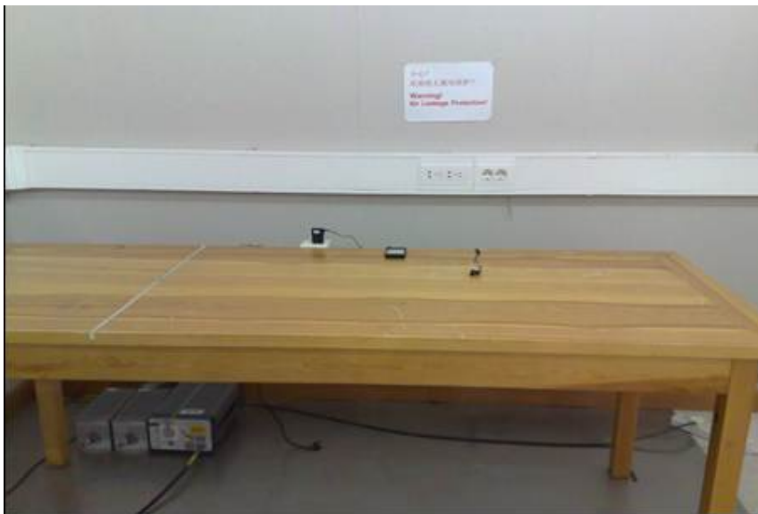
Picture 4. FCC Part 15C AC powerline conducted emissions