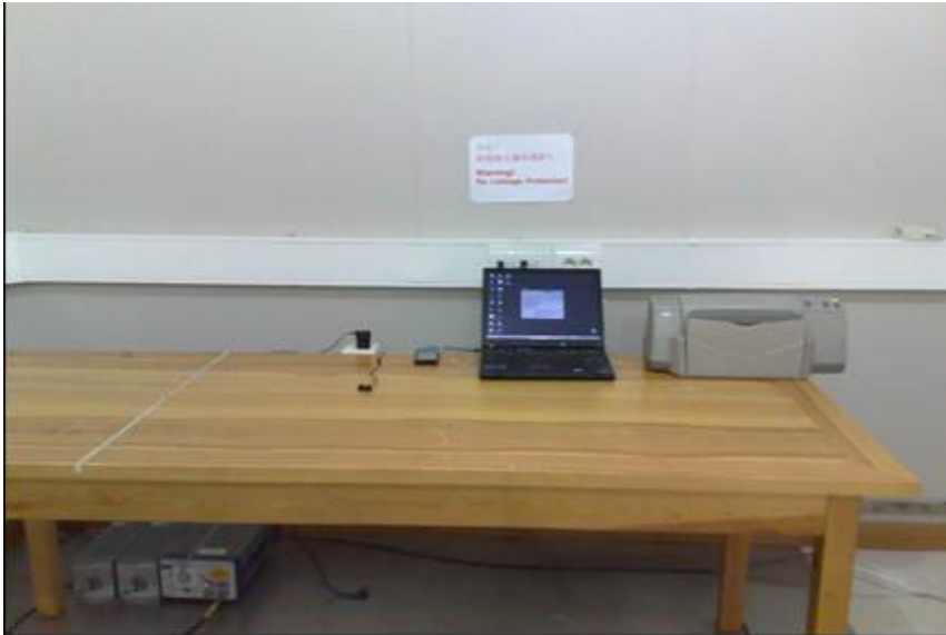
Picture 5. FCC Part 15B AC powerline conducted emissions, computer peripherals