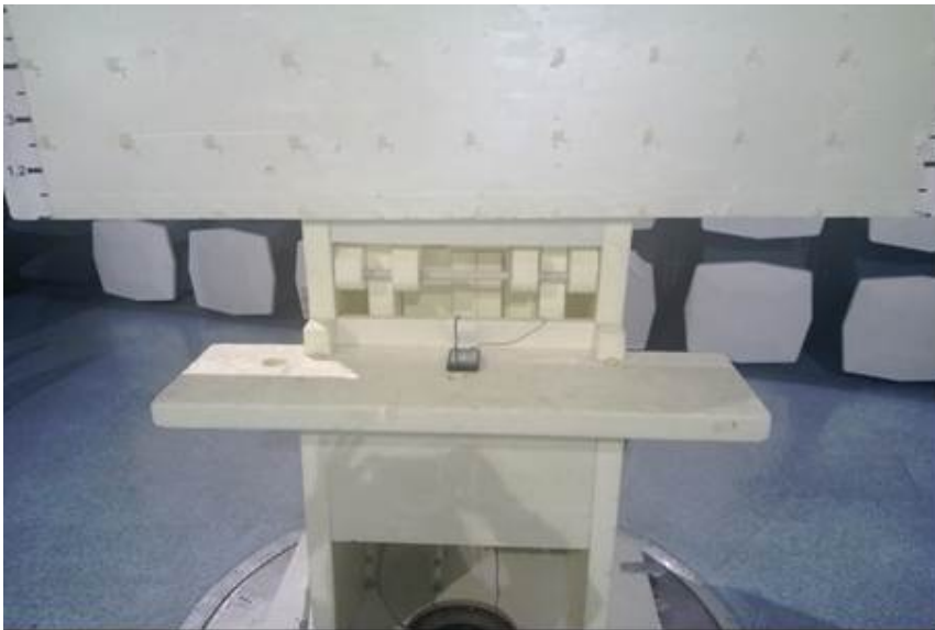
Picture 2. FCC Part 15B Radiated emissions