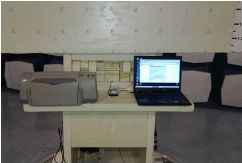
Picture 3. FCC Part 15B Radiated emissions, computer peripherals