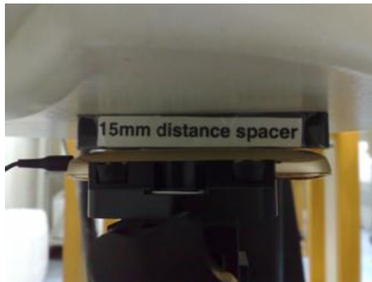
Photo of the device positioned for Body SAR measurement. The spacer was removed for the tests.

The device was placed in the SPEAG holder using the Nokia spacer and placed below the flat section of the phantom. The distance between the device and the phantom was kept at the separation distance indicated in the photo below using a separate flat spacer that was removed before the start of the measurements. The device was oriented with both sides facing the phantom to find the highest results.