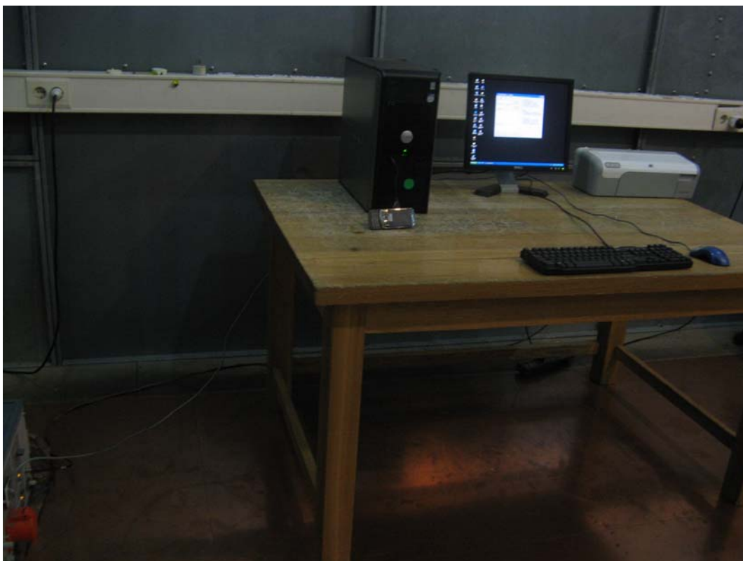
Picture 2 AC powerline conducted emission measurement 15B