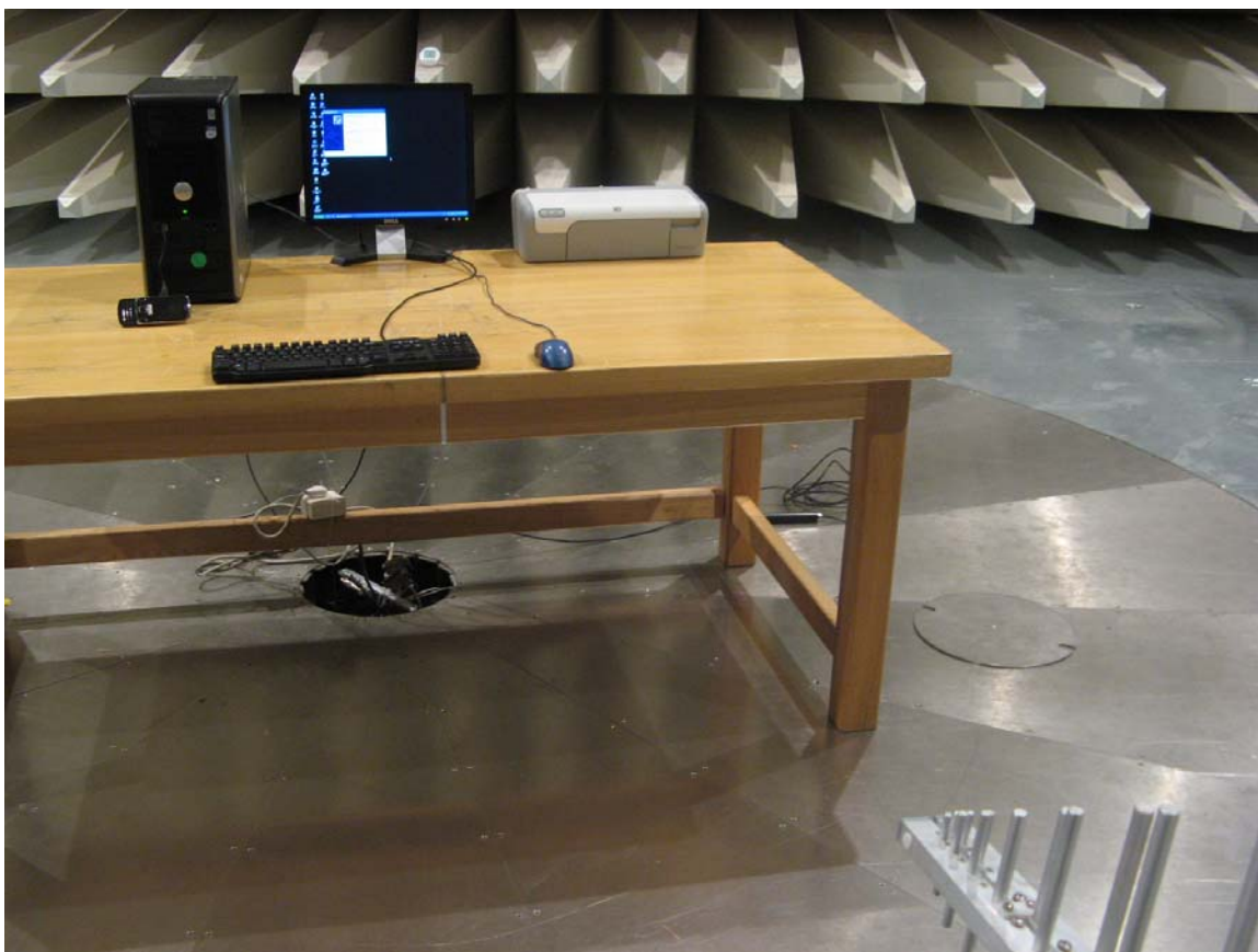
Picture 1 Radiated emission 15B