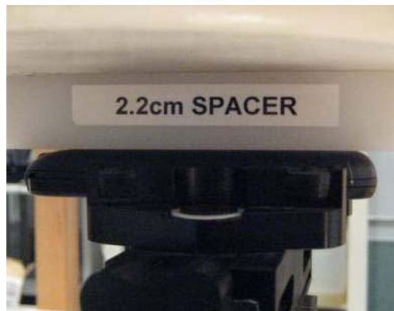
Photo of the device positioned for Body SAR measurement. The spacer was removed for the tests.

The device was placed in the SPEAG holder using the Nokia spacer and placed below the flat section of the phantom. The distance between the device and the phantom was kept at the separation distance indicated in the photo below using a separate flat spacer that was removed before the start of the measurements. The device was oriented with both sides facing the phantom to find the highest results.