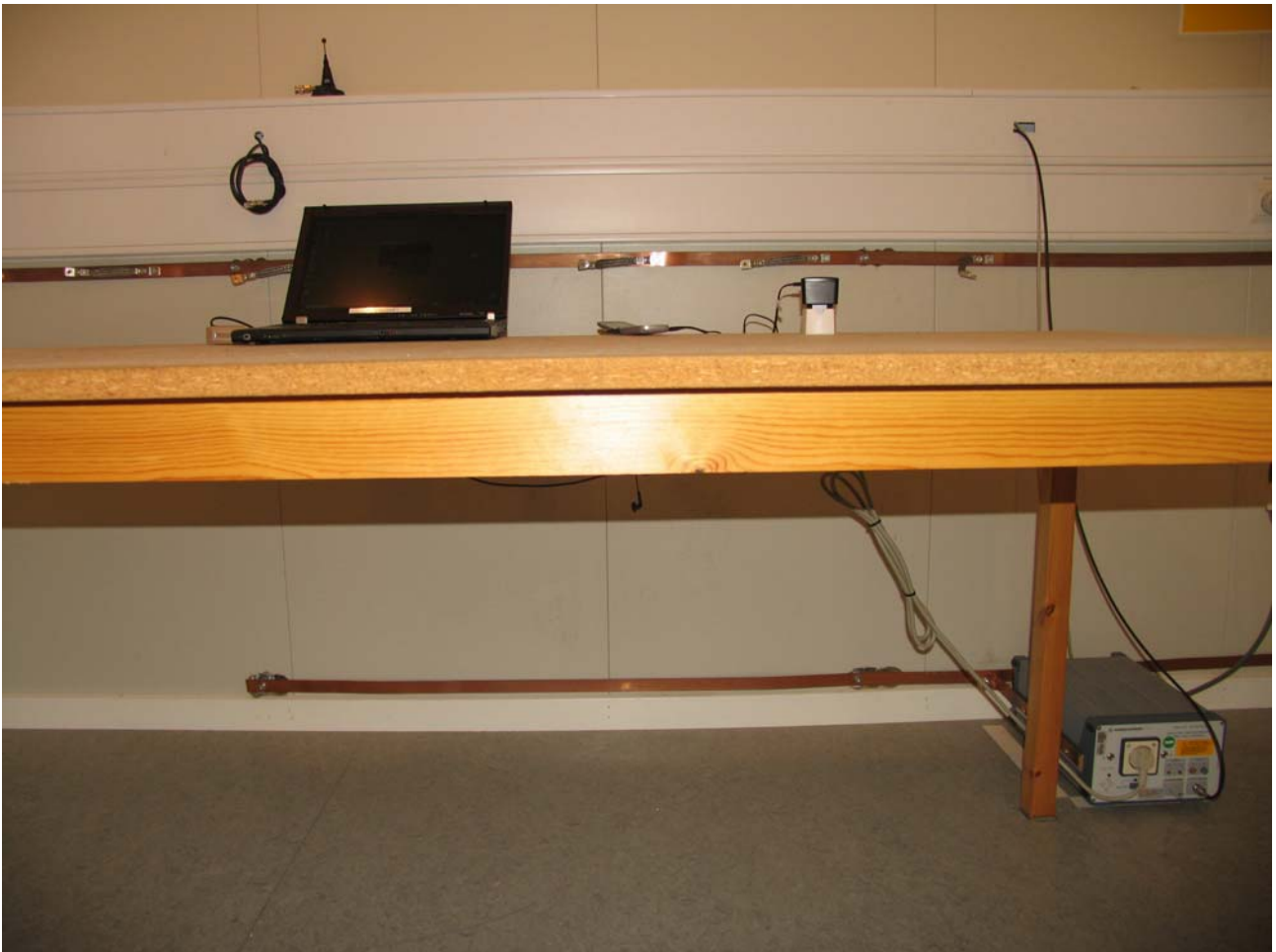
Picture 2 AC powerline conducted emission measurement 15B