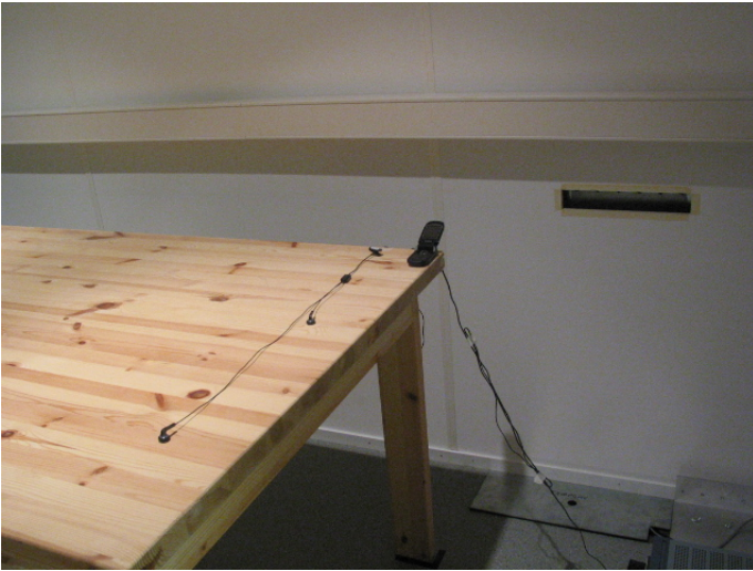
Picture 3 AC powerline conducted emission measurement GSM RX / Bluetooth TX