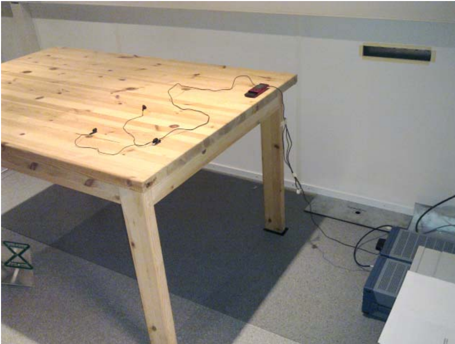
Picture 3. FCC Part 15C AC powerline conducted emissions