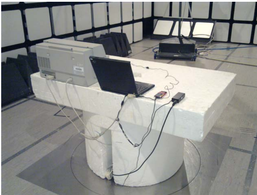
Picture 2. FCC Part 15B Radiated emissions