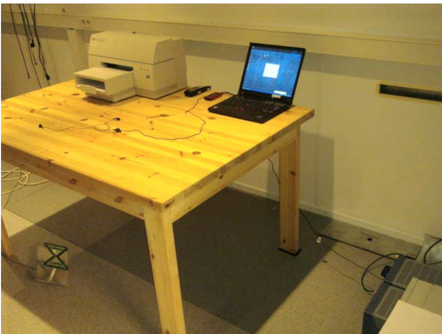
Picture 4. FCC Part 15B AC powerline conducted emissions