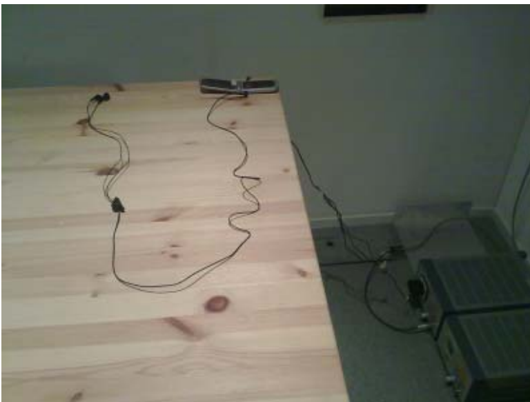
Picture 2 AC powerline conducted emission measurement 15C