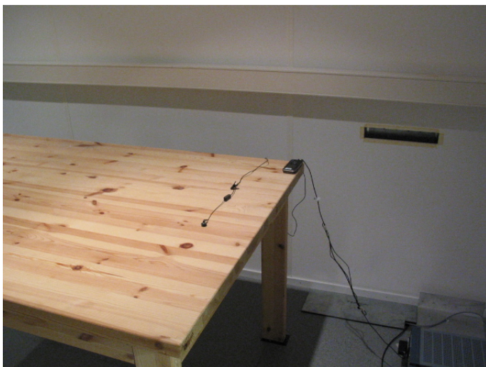
Picture 3 AC powerline conducted emission measurement Bluetooth TX