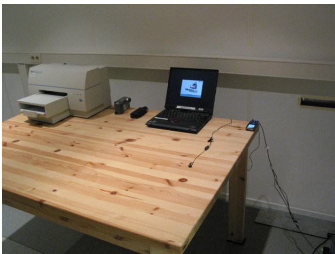
Picture 4 AC powerline conducted emission measurement GSM RX / Bluetooth TX + Computer peripherals