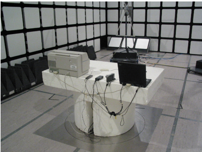
Picture 2 Radiated emission measurement GSM RX / Bluetooth TX + Computer peripherals