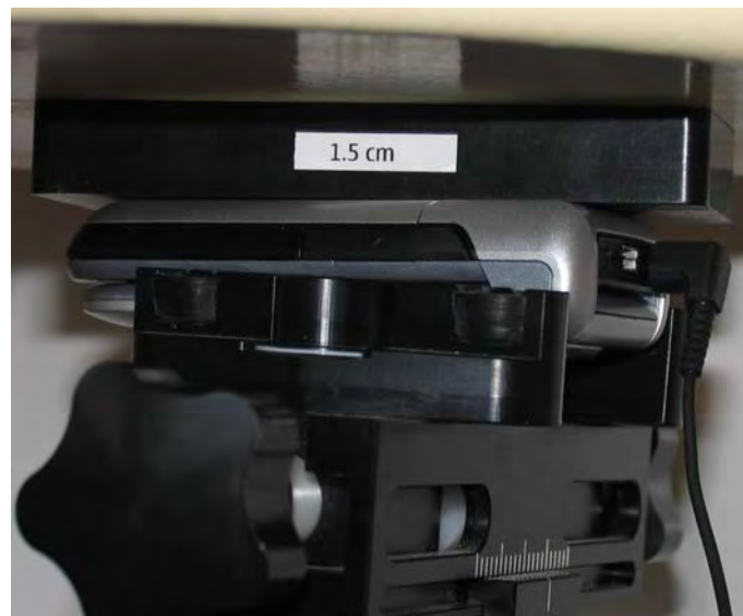
Photo of the device positioned for Body SAR measurement. The spacer was removed for the tests.

The device was placed in the SPEAG holder using the Nokia spacer and placed below the flat section of the phantom. The distance between the device and the phantom was kept at the separation distance indicated in the photo below using a separate flat spacer that was removed before the start of the measurements. The device was oriented with its antenna facing the phantom since this orientation gives higher results.