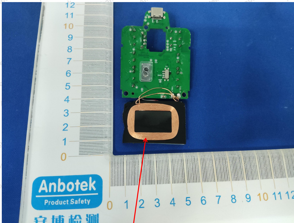
WPT ANT (RX only)