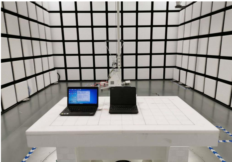
Fig.2 Radiated emission setup photo(30MHz-1GHz)