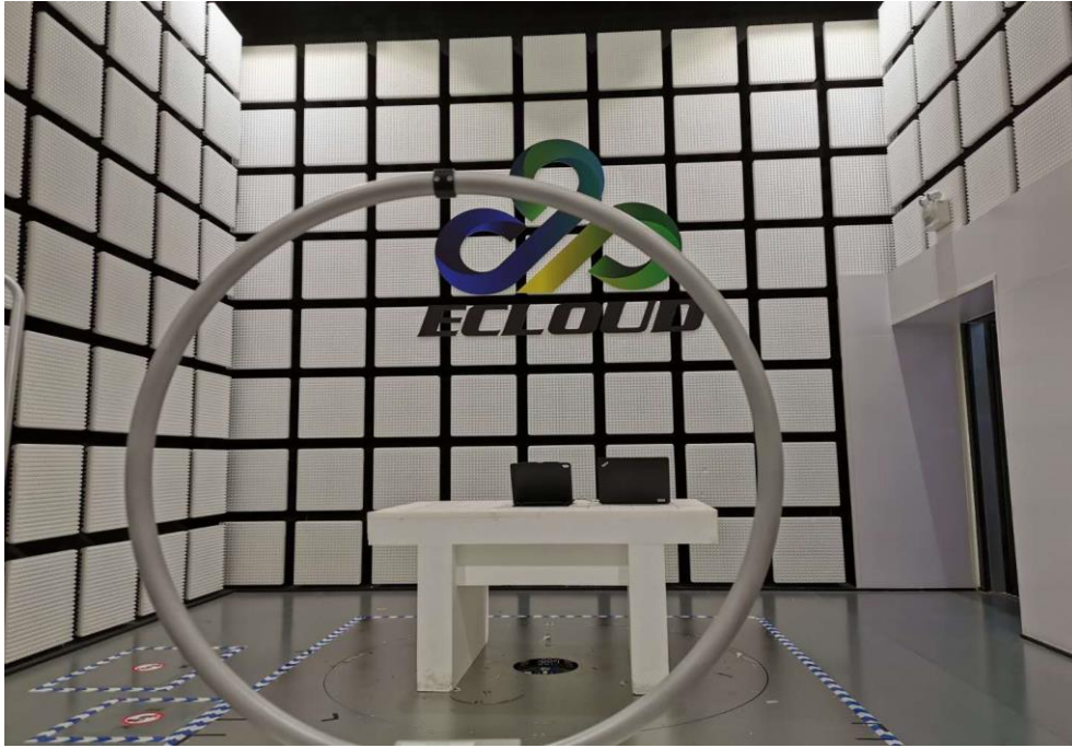
Fig.1 Radiated emission setup photo(Below 30MHz)