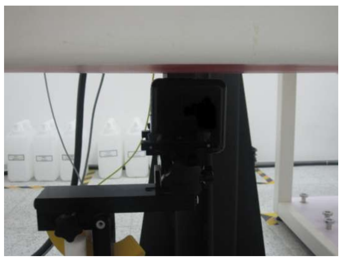
POSITION OF BODY right side WITH 5mm DISTANCE