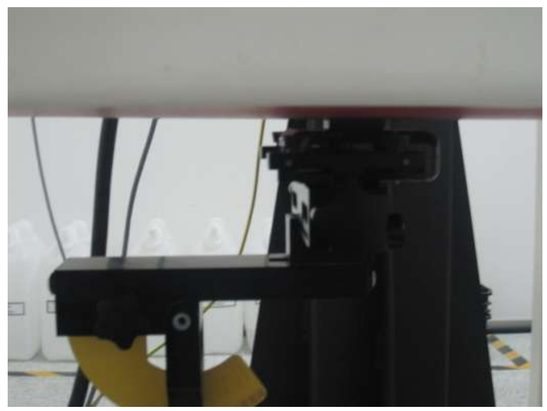
POSITION OF BODY TOWARDS GROUND WITH 5mm DISTANCE