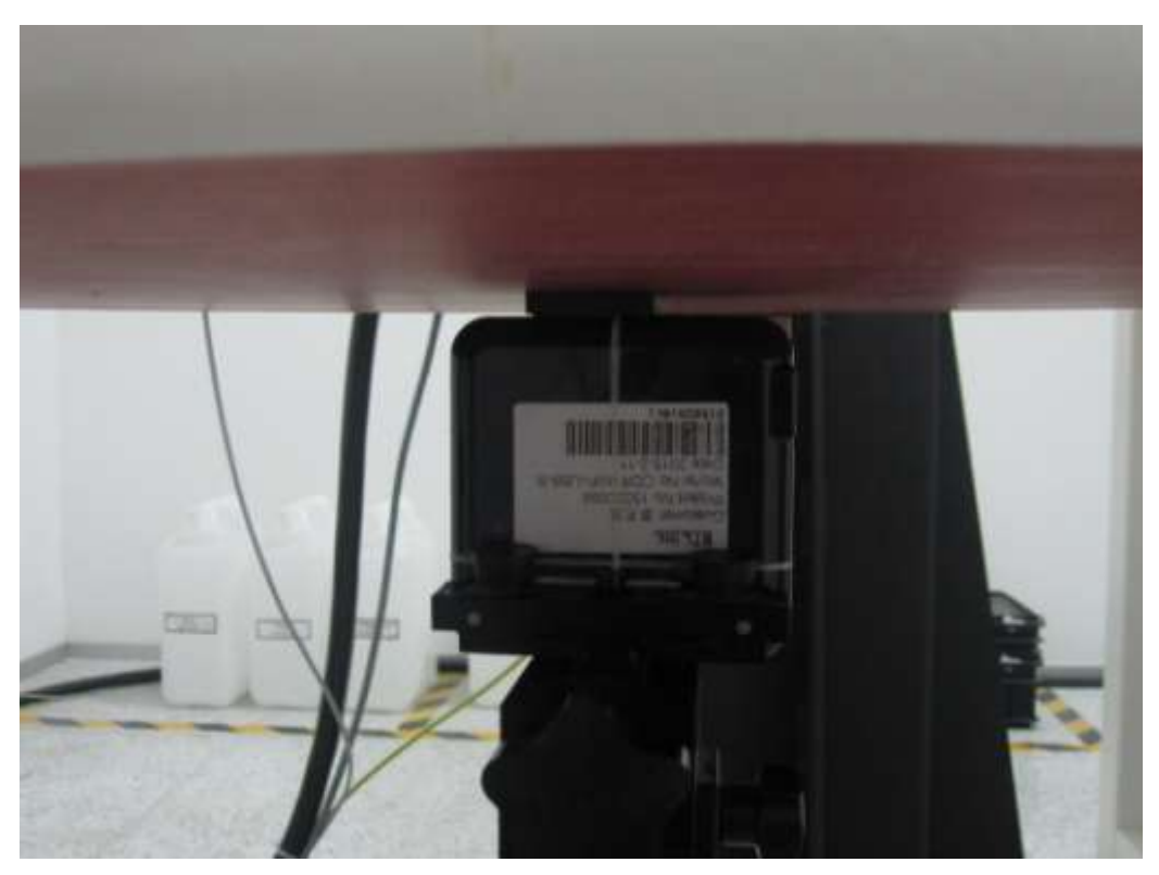
POSITION OF BODY FRONT 5mm DISTANCE