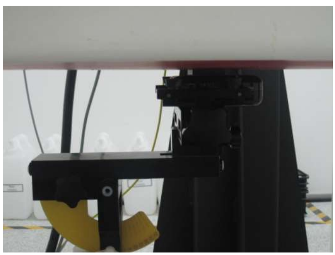
POSITION OF BODY TOWARDS PHANTOM WITH 5mm DISTANCE