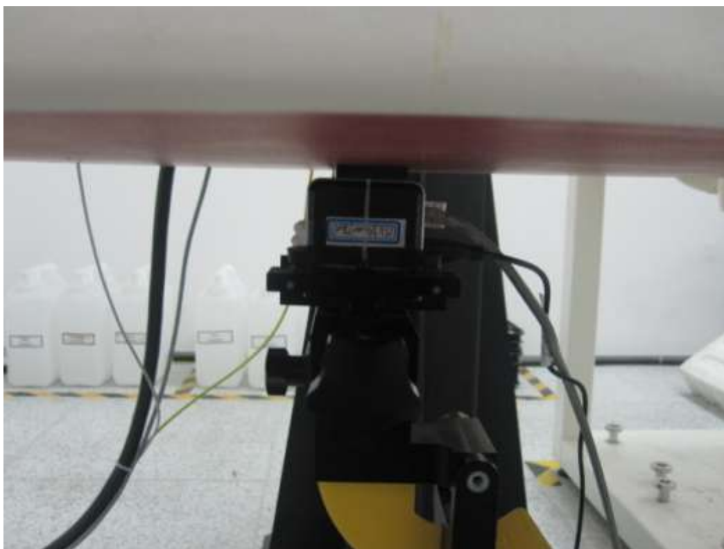
POSITION OF BODY FRONT 5mm DISTANCE