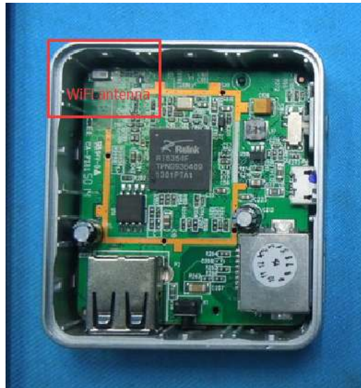
Picture of antennas