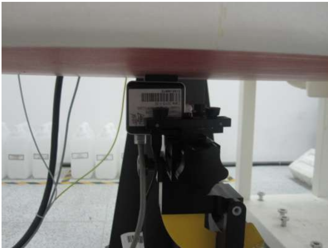
POSITION OF BODY right side WITH 5mm DISTANCE