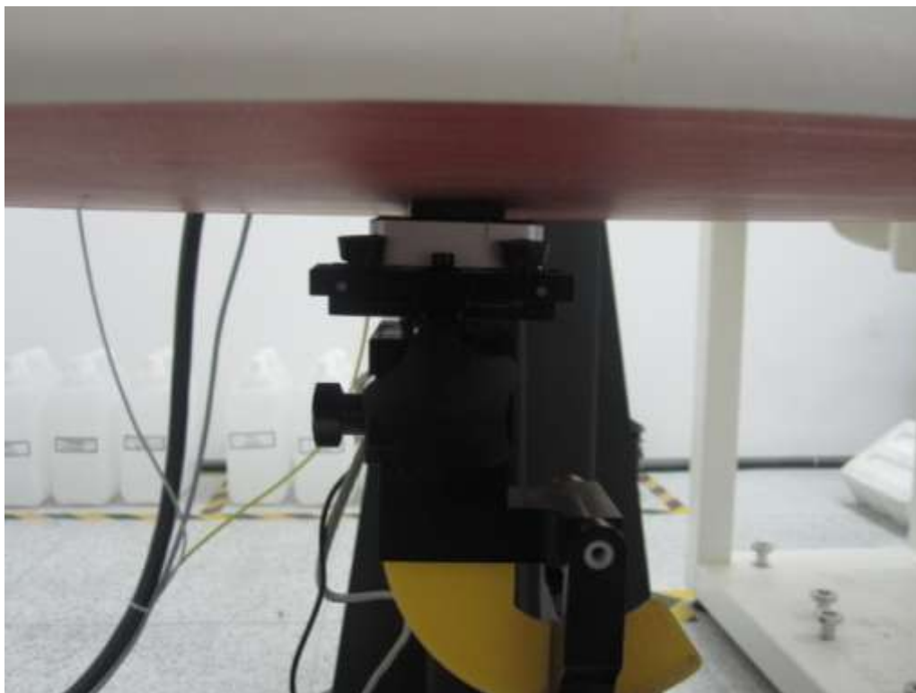
POSITION OF BODY TOWARDS PHANTOM WITH 5mm DISTANCE