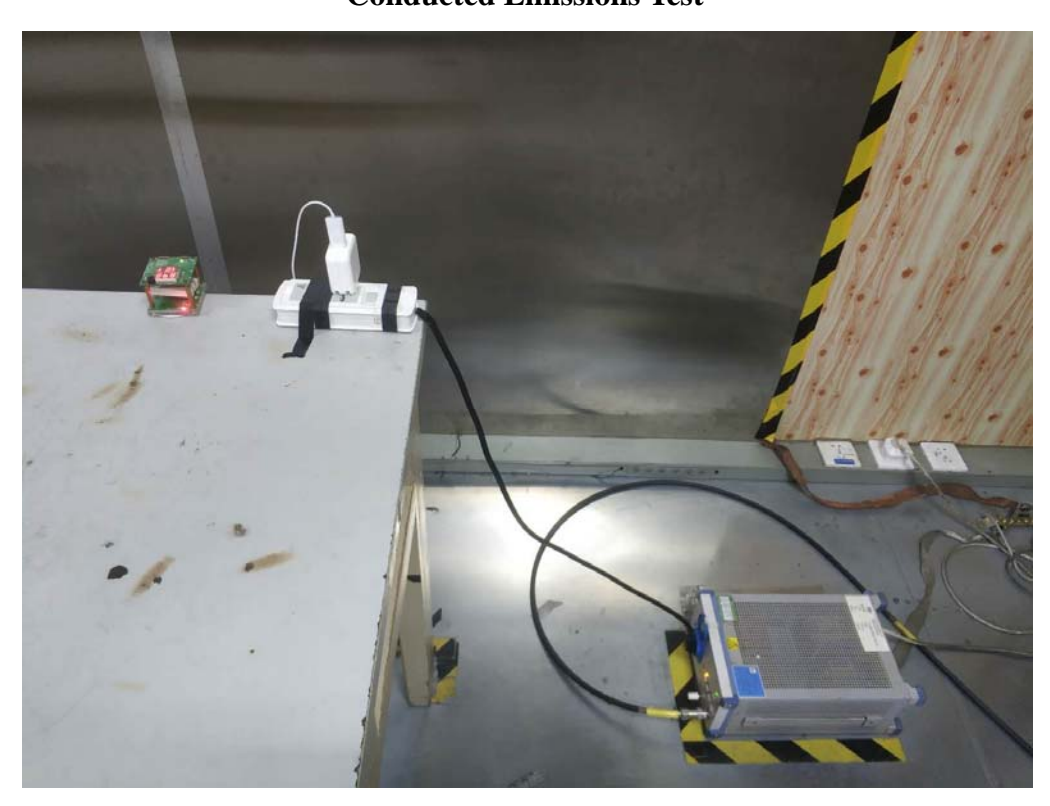
Conducted Emissions Test