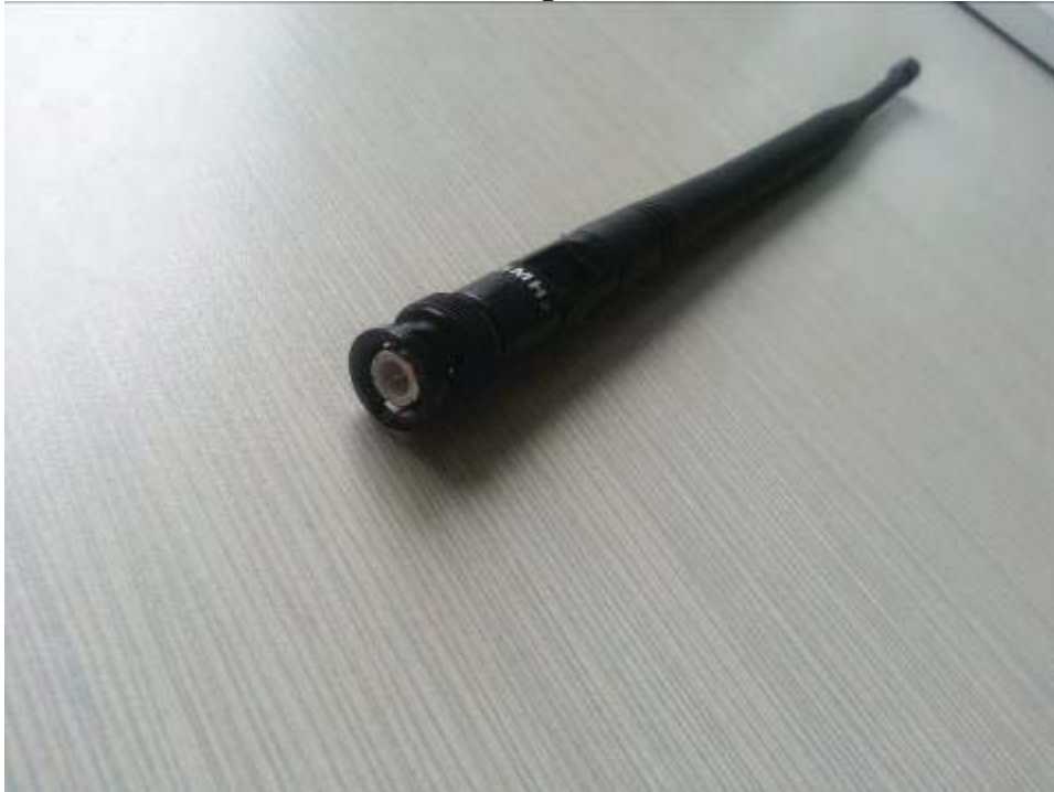
Antenna: length = 25 cm