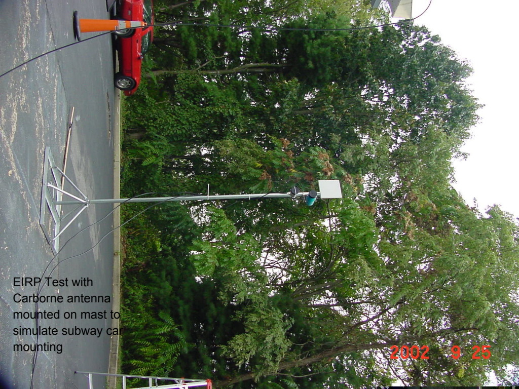
EIRP Test with Carbone antenna mounted on mast to simulate subway car mounting