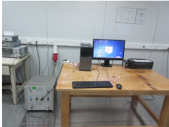
Radiated Emission (30MHz-1GHz) Connect to PC