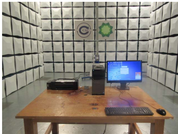
Radiated Emission (above 1GHz) Connect to PC