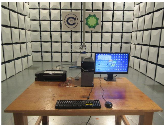
Radiated Emission (above 1GHz) Connect to PC