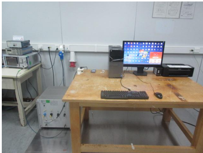
Radiated Emission (30MHz-1GHz) Connect to PC