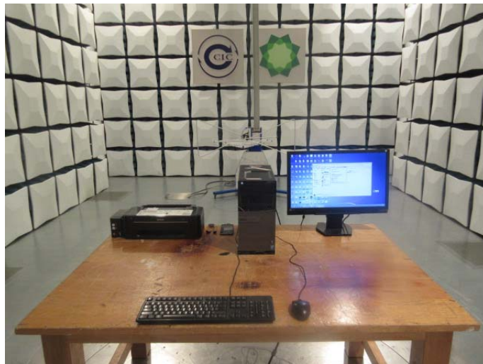
Radiated Emission (above 1GHz) Connect to PC