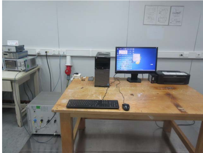
Radiated Emission (30MHz-1GHz) Connect to PC