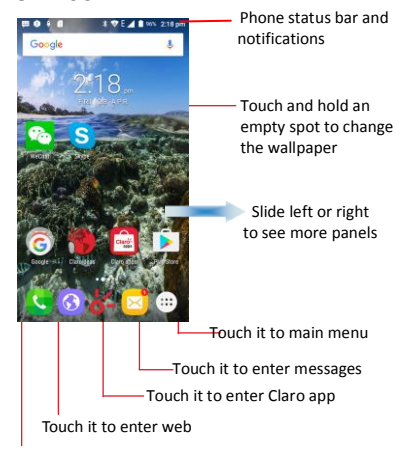
Touch it to enter dial pad interface