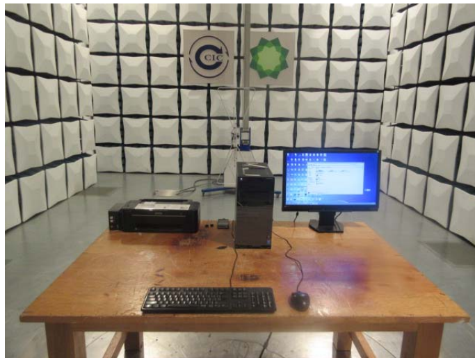
Radiated Emission (above 1GHz) Connect to PC