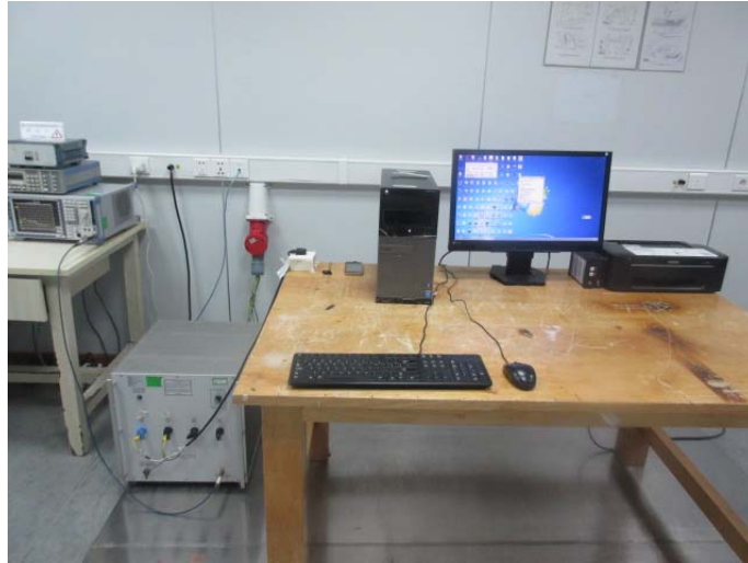
Radiated Emission (30MHz-1GHz) Connect to PC