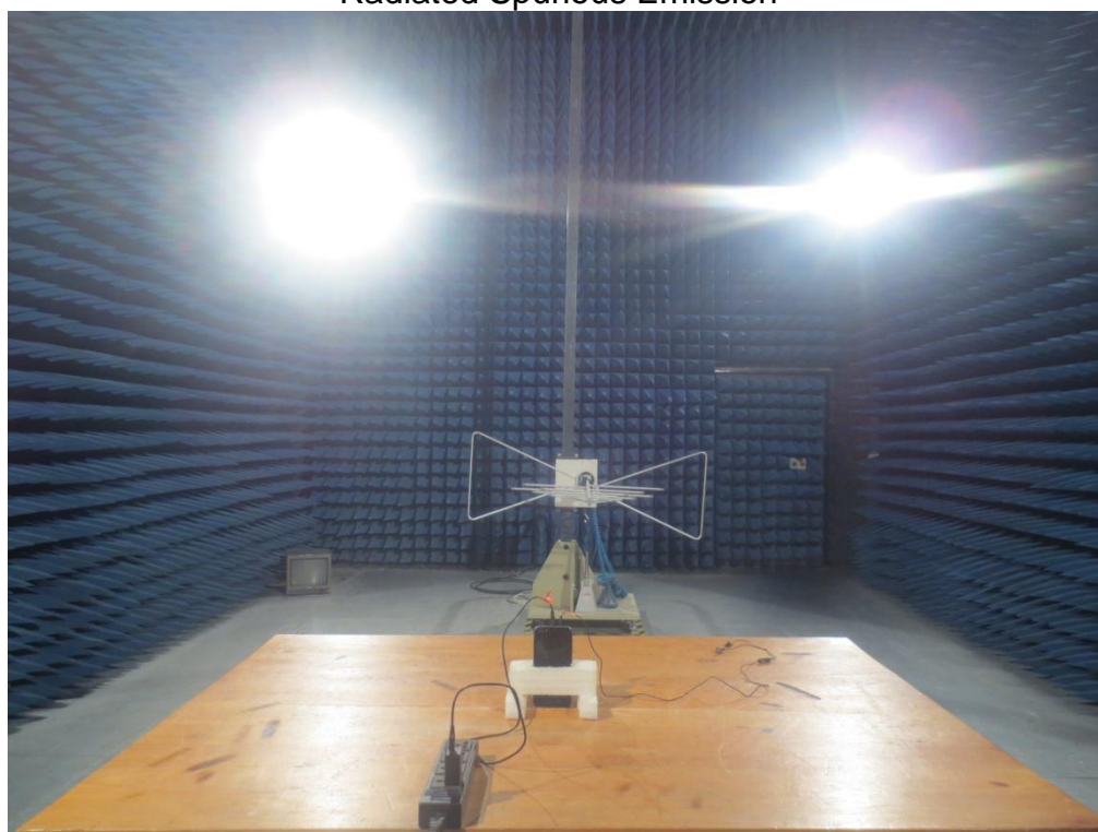
Radiated Spurious Emission