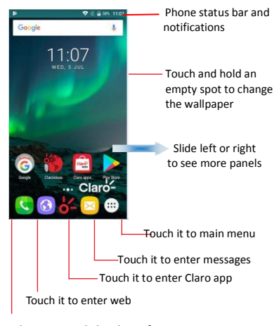
Touch it to enter dial pad interface