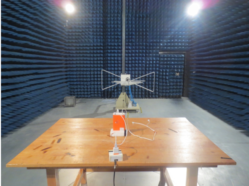
Radiated Spurious Emission