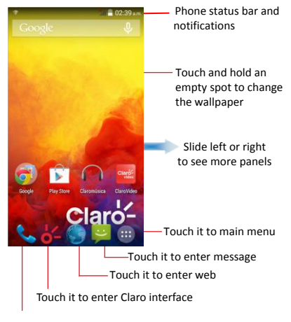
Touch it to enter dial pad interface