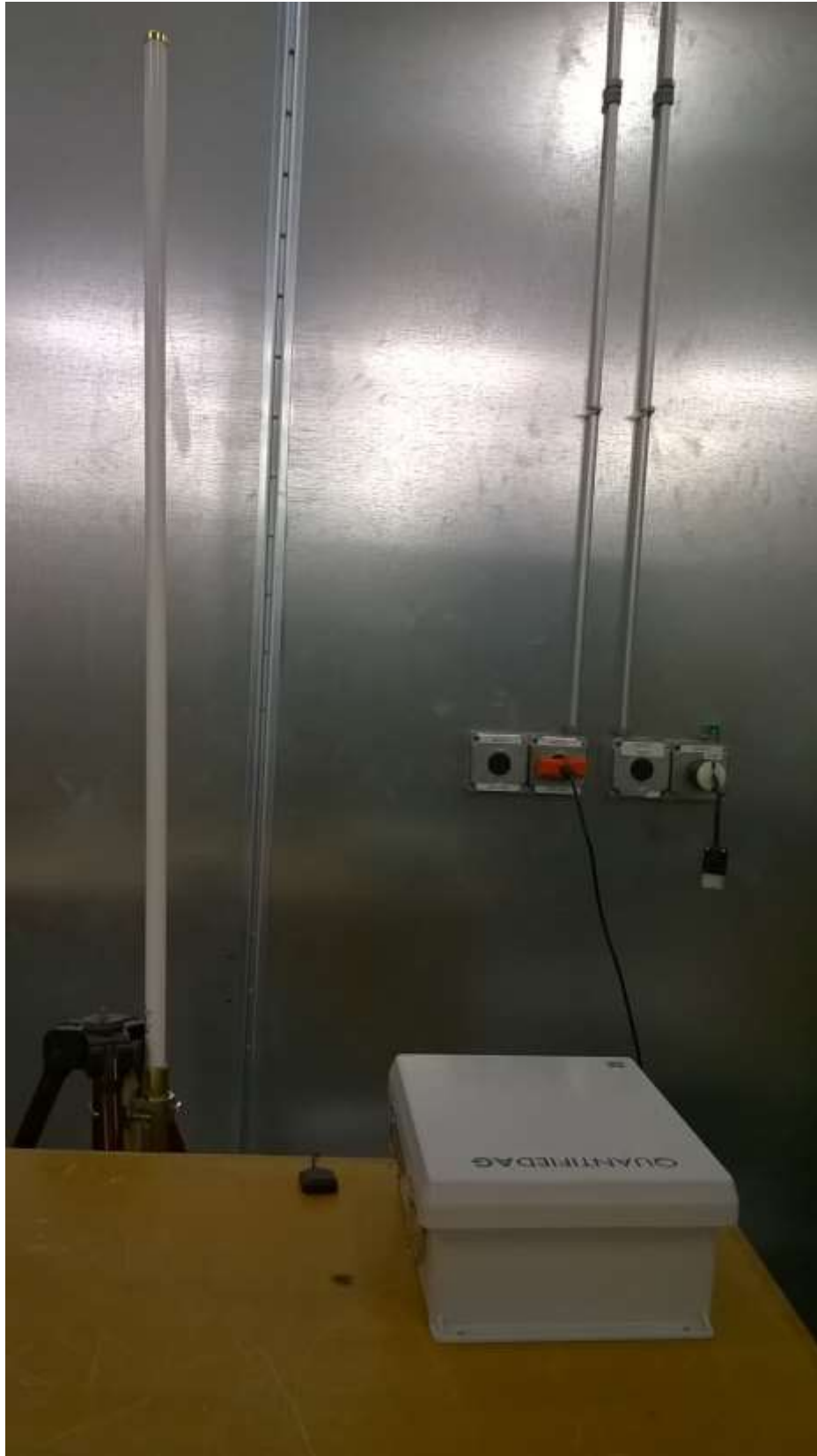
Figure 5 - Conducted Emissions Test Setup