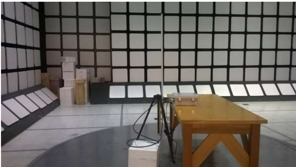
Figure 2 - Radiated Emissions Test Setup, 30MHz - 1GHz, Monopole Antenna