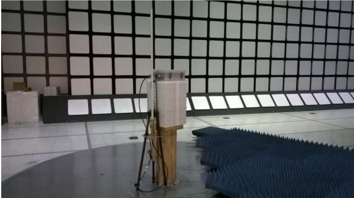
Figure 1 - Radiated Emissions Test Setup, 1GHz - 25GHz, Monopole Antenna