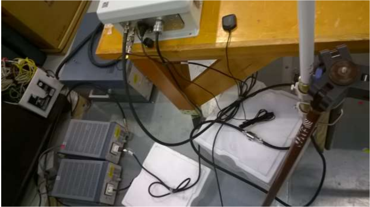
Figure 6 - Conducted Emissions Test Setup