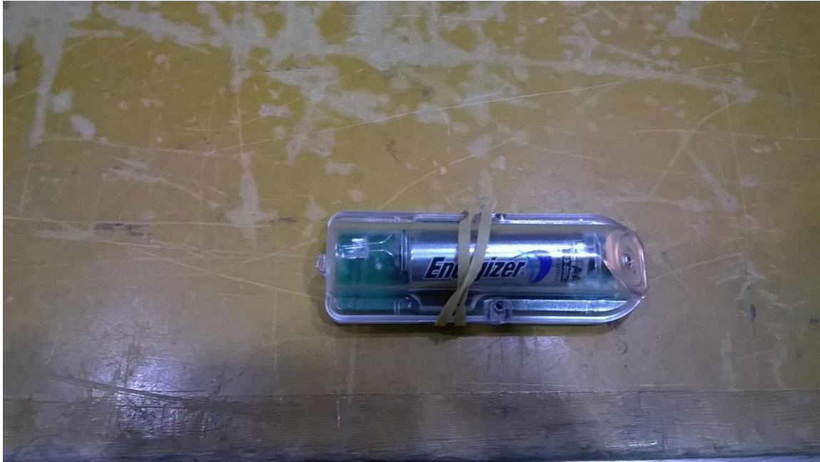
Figure 3 – Radiated Emissions Test Setup, Y-axis, 30MHz – 1GHz