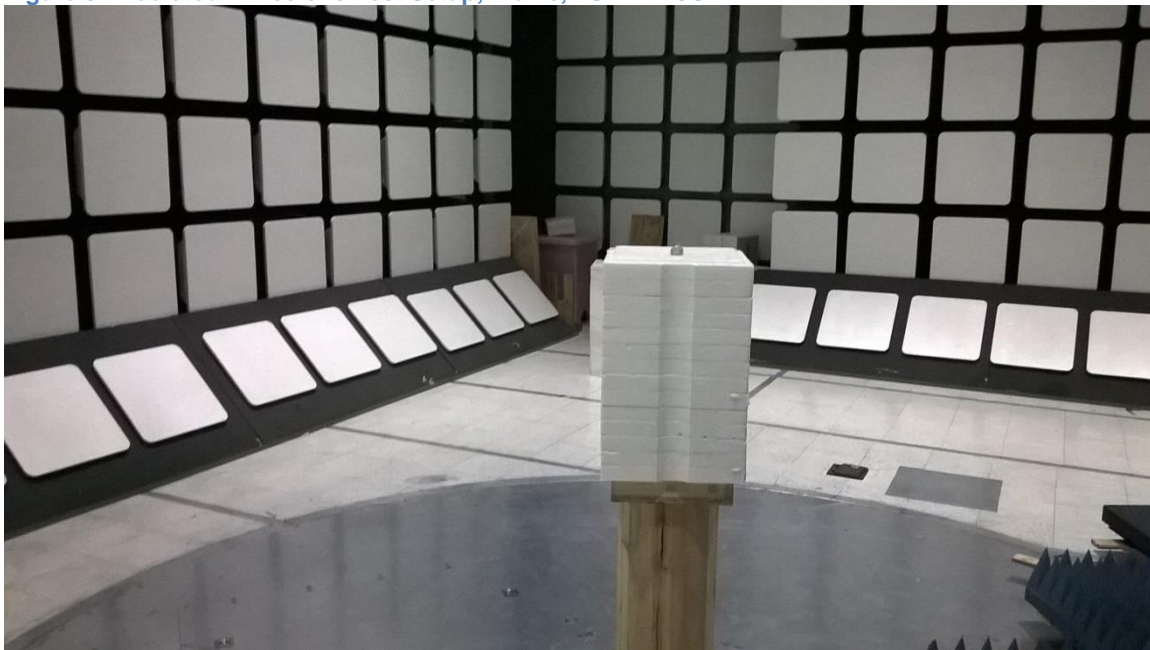
Figure 6 - Radiated Emissions Test Setup, Y-axis, 1GHz – 25GHz