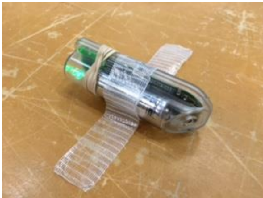
Figure 4 - Radiated Emissions Test Setup, Z-axis, 30MHz – 1GHz