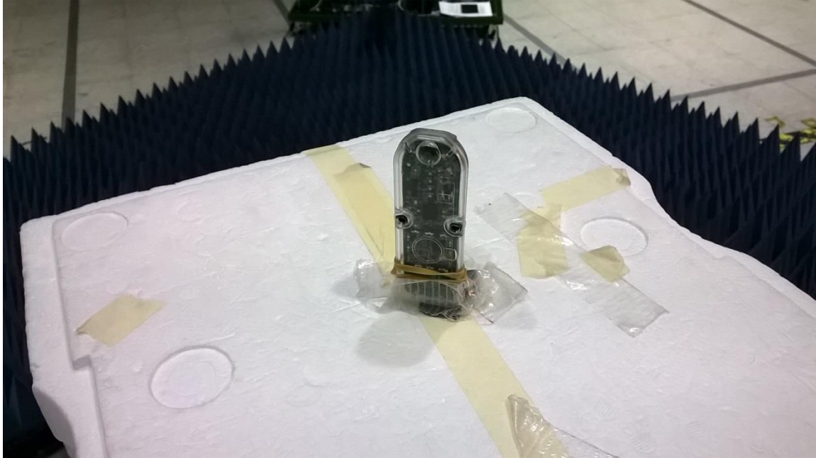
Figure 5 - Radiated Emissions Test Setup, X-axis, 1GHz – 25GHz