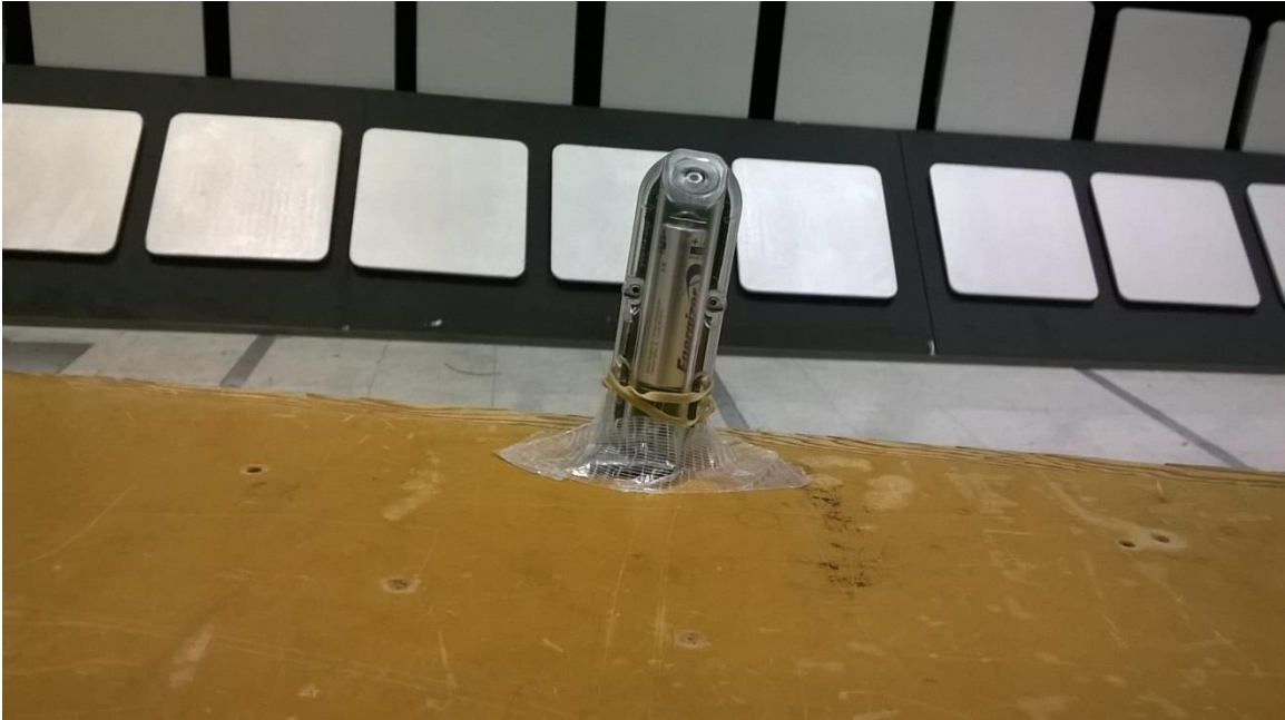
Figure 1 – Radiated Emissions Test Setup, Vertical, 30MHz – 1GHz