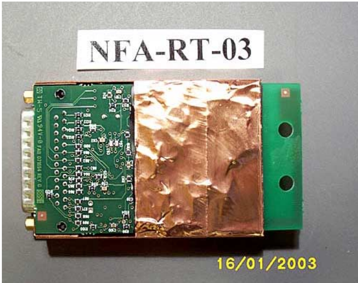
Bottom of RF Module