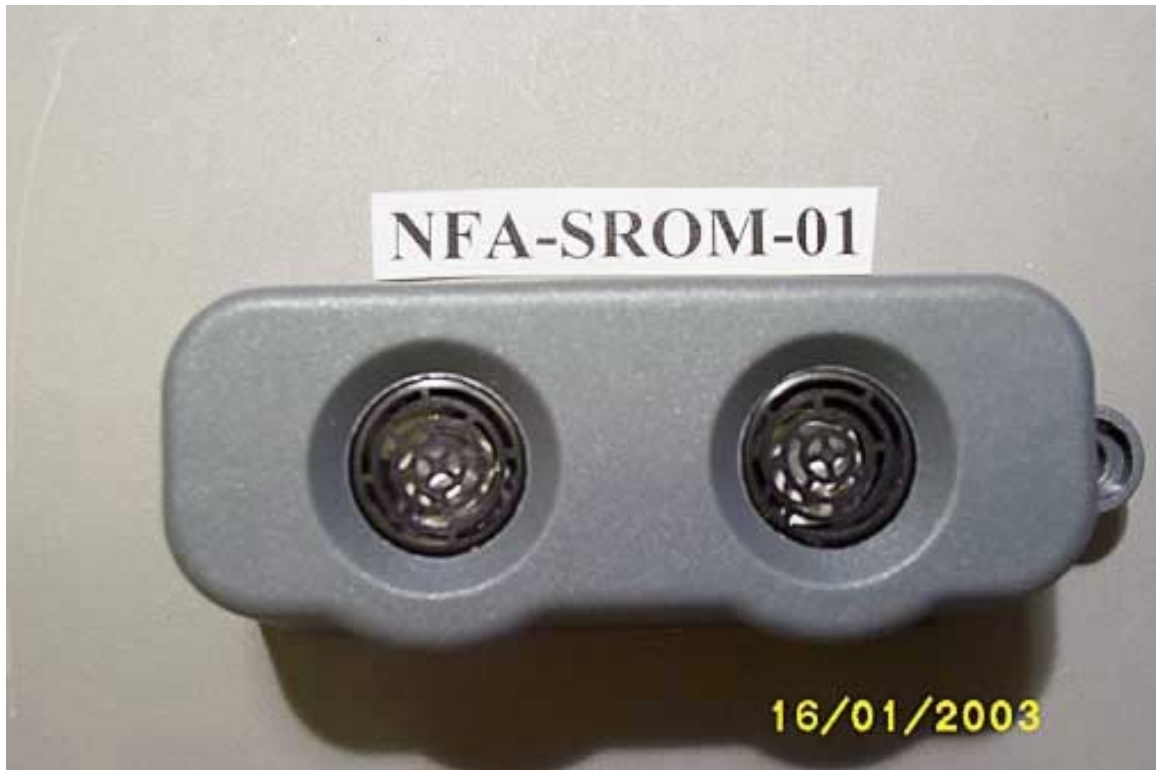
NFA-SROM-01 Range of Motion Sensor, Top