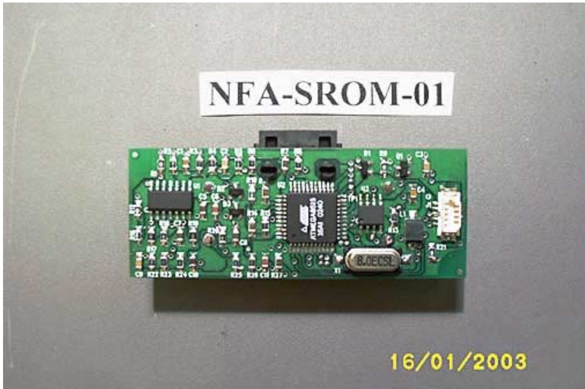
NFA-SROM-01 Range of Motion Sensor, Bottom of PCB