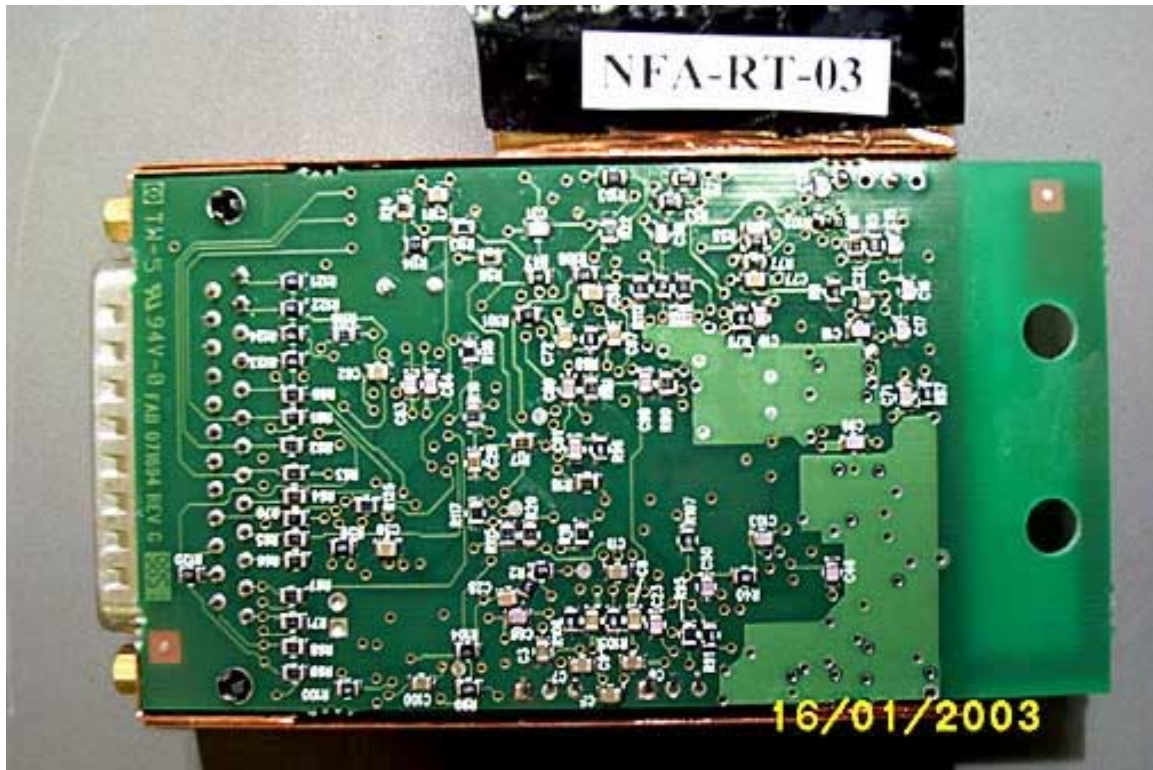
Bottom of RF Module (PCB) with Shield Removed