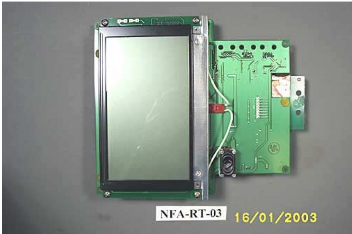
LCD on Main Board