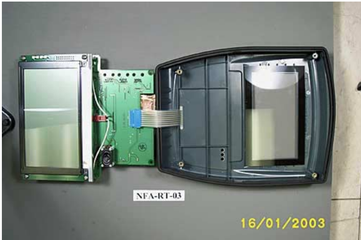
Board with LCD, Connected to Front Cover with Keypad Cable