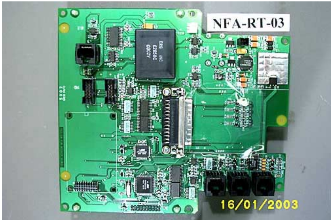
Back of Main Board with RF Module Removed