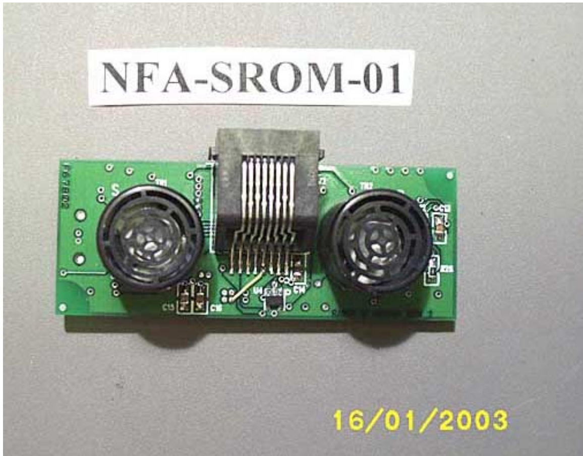
NFA-SROM-01 Range of Motion Sensor, Top of PCB