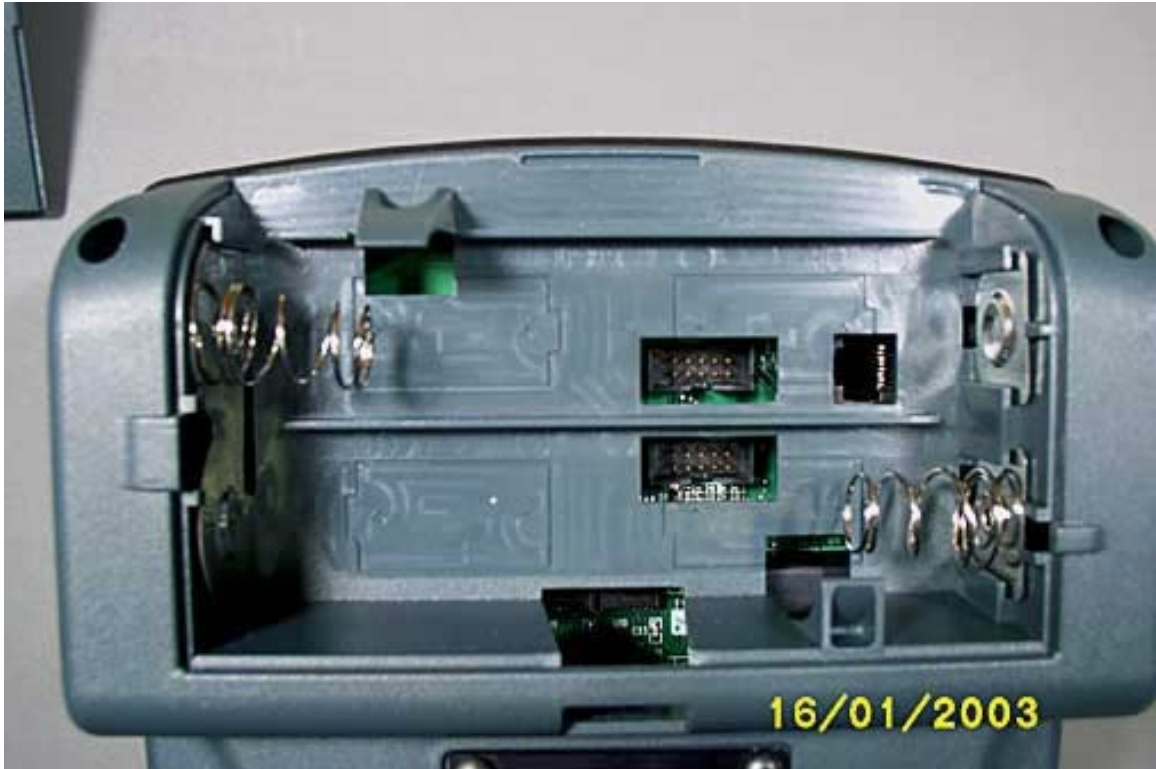
Battery Compartment in Back