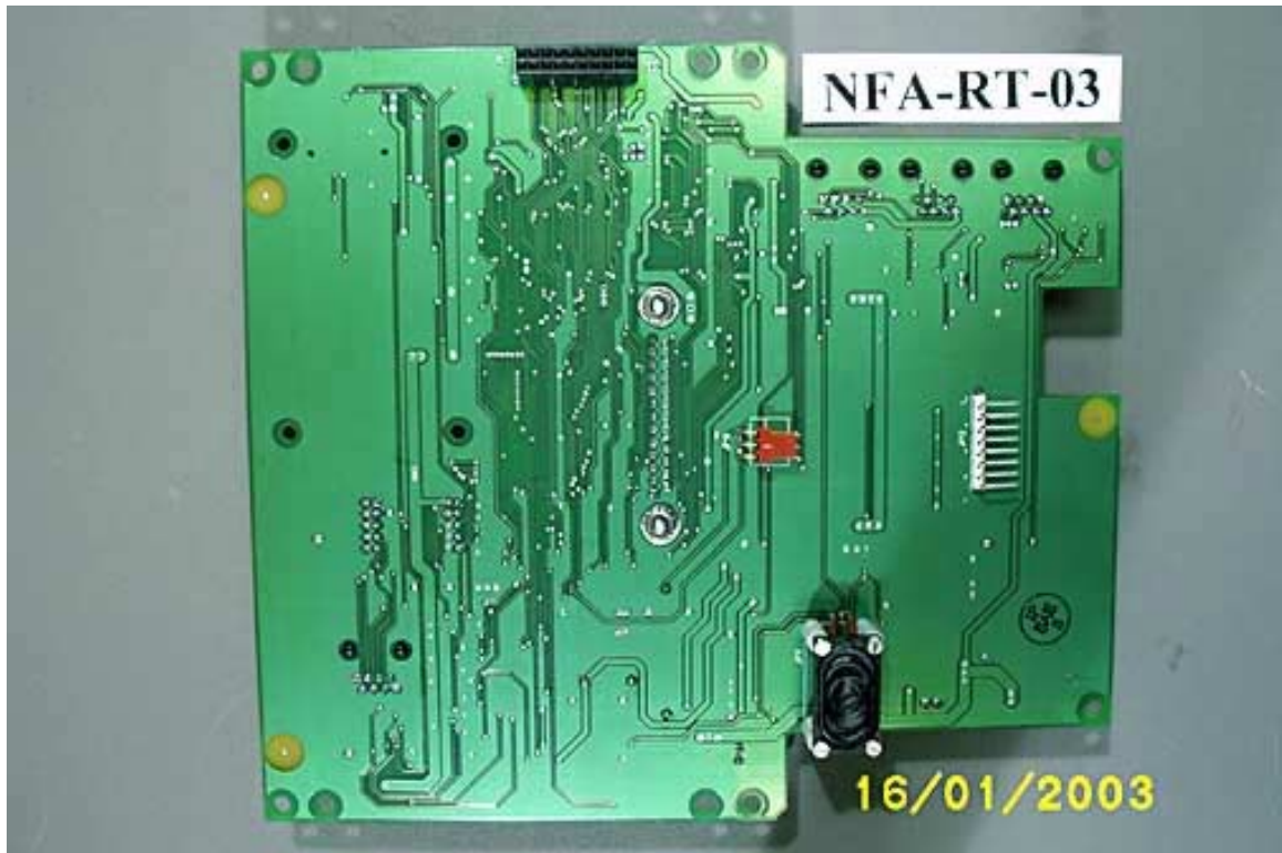
Front of Main Board with LCD Removed