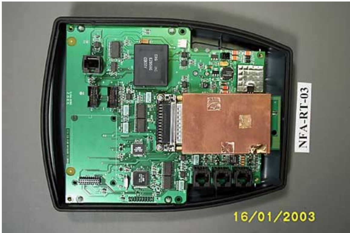
Unit with Back Cover Removed