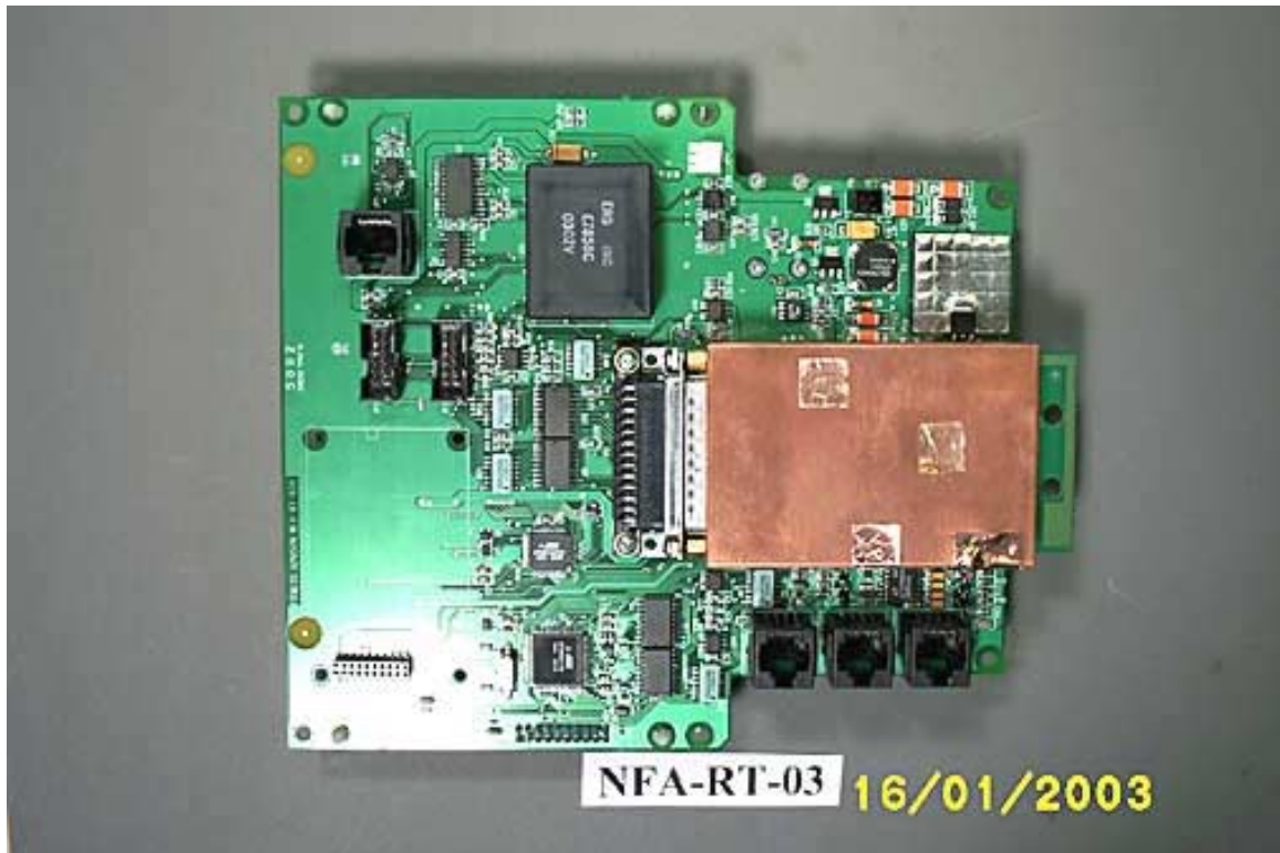
Back of Main Board with RF Module Installed