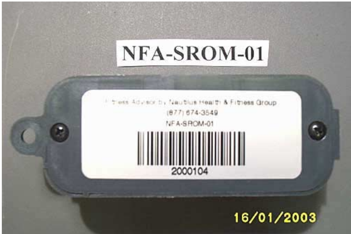
NFA-SROM-01 Range of Motion Sensor, Bottom