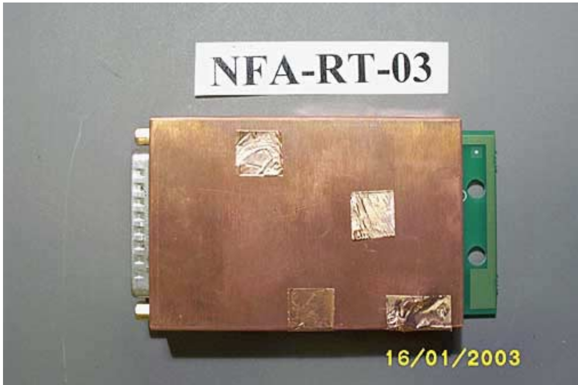
Top of RF Module