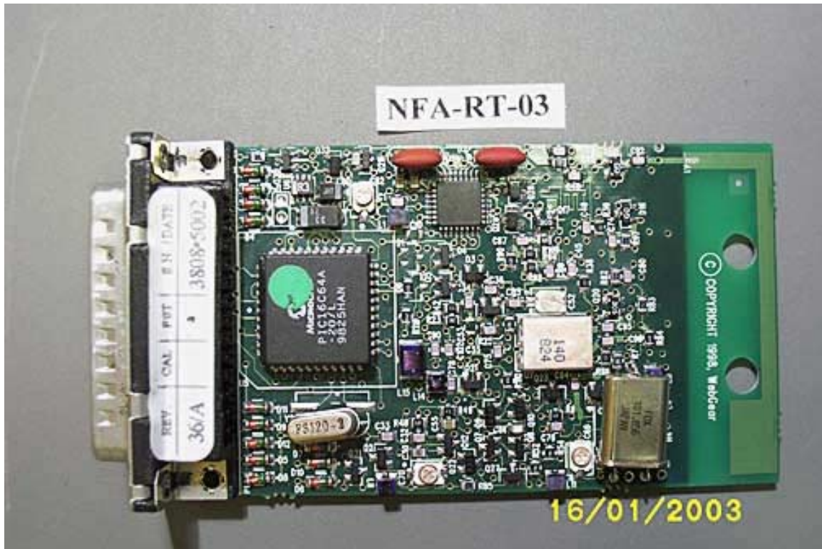
Top of RF Module (PCB) with Shield Removed