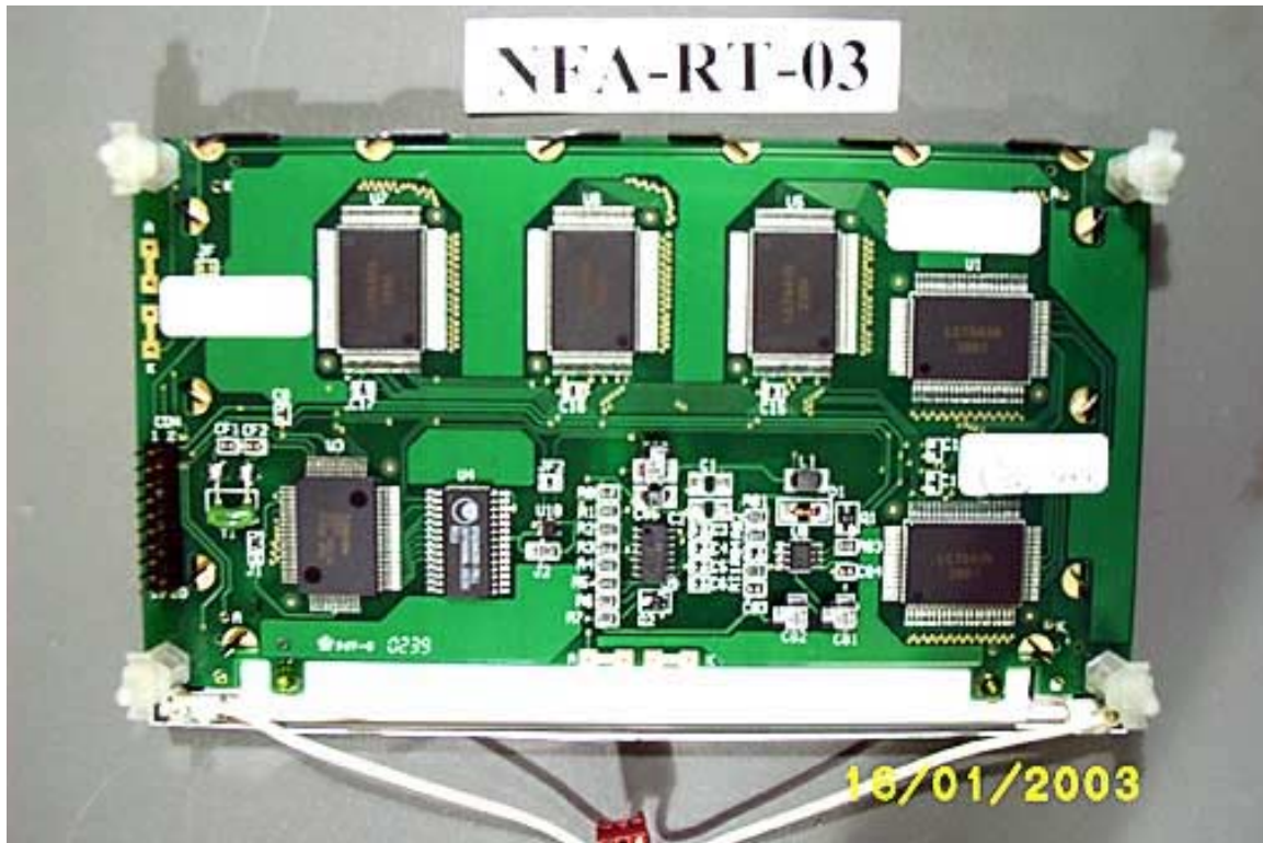
Back of LCD