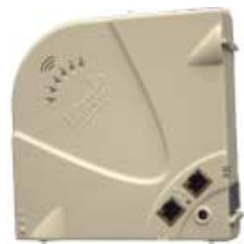
Figure 3: GigAccess™ RSU

The RSU is a revolutionary radio modem that has no installation and no client software. It's a self-install pure plug and play device that eliminates truck roles, technician fees and lot of installation time.