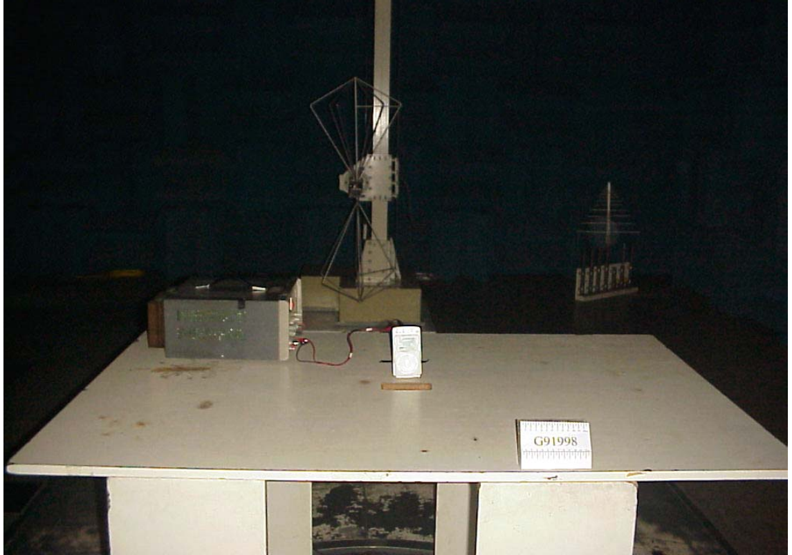
FRONT VIEW OF RADIATED TEST