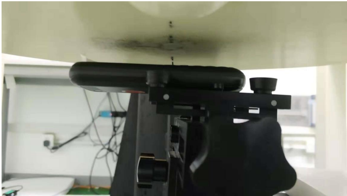
Toward Phantom (15mm)

According to the antenna position, the Body SAR is tested at the following 2 test positions all with the distance =15mm between the EUT and the phantom bottom :