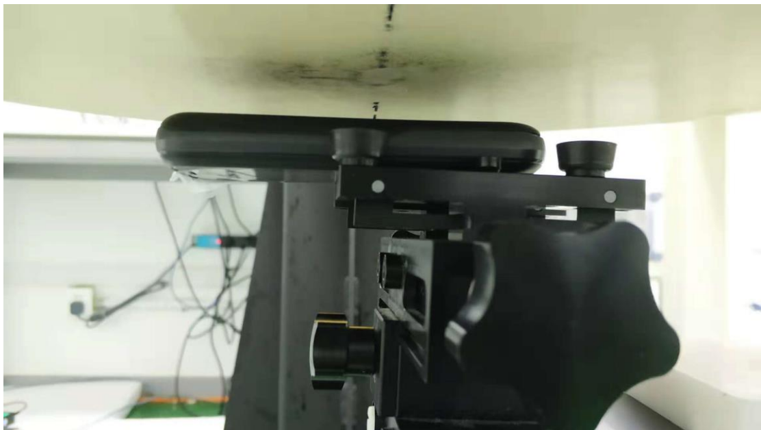
Toward Ground (15mm)