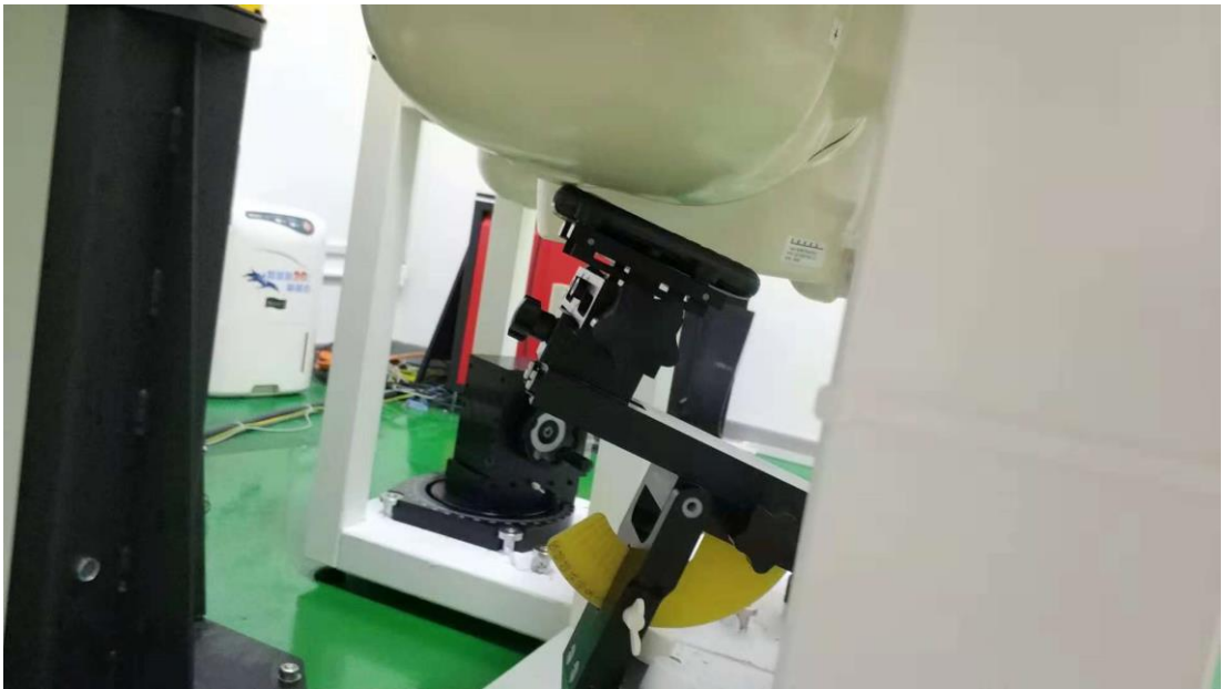
Right Head Tilt 15° Position