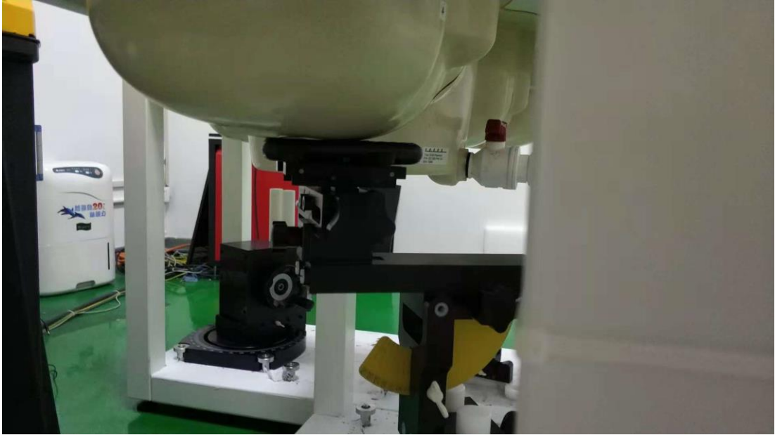
Right Head Touch Cheek Position