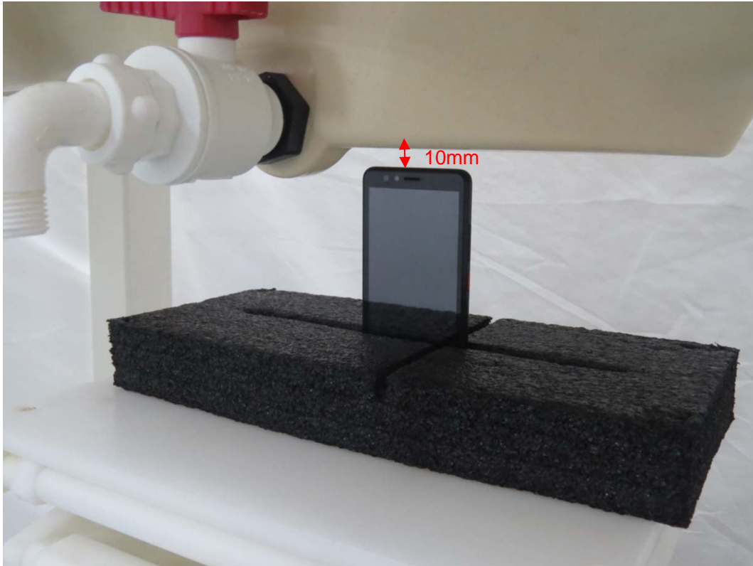
Picture 11: Top Side, the distance from handset to the bottom of the Phantom is 10mm