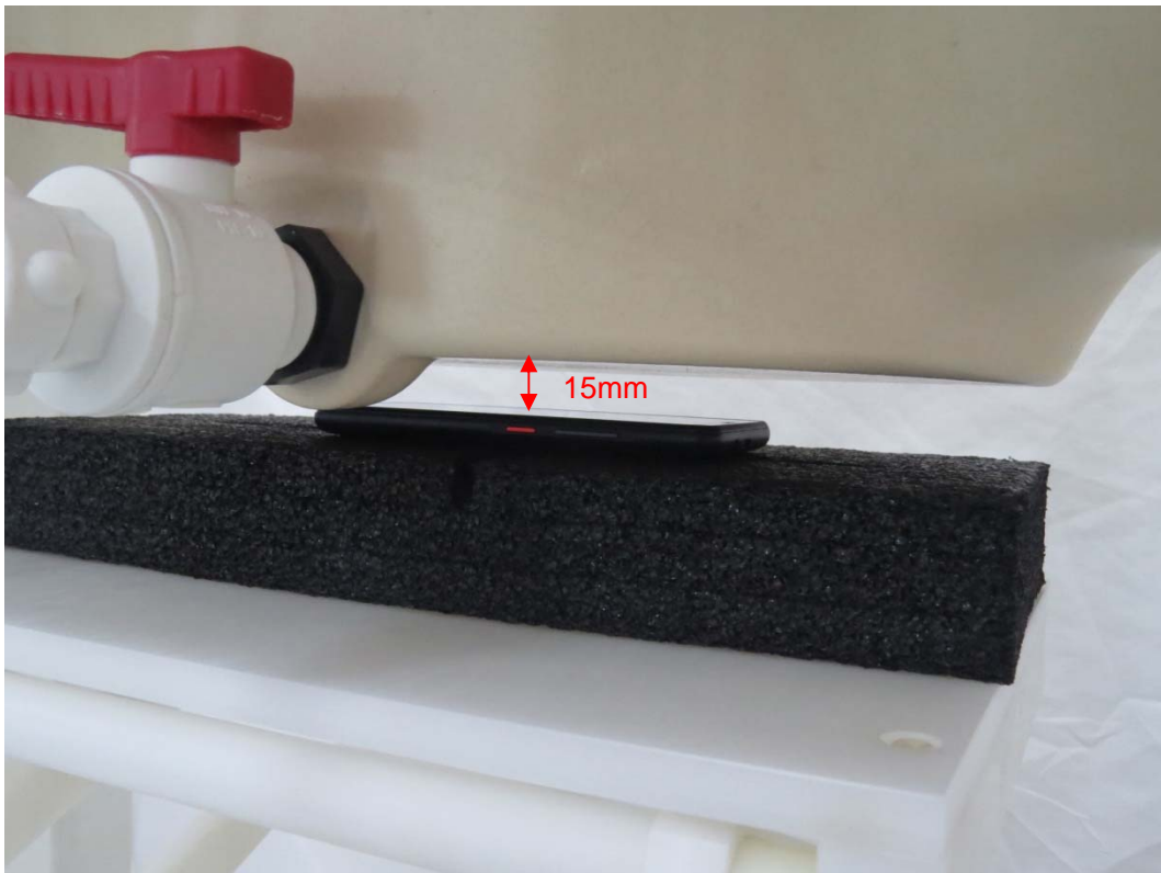
Picture 6: Front Side, the distance from handset to the bottom of the Phantom is 15mm