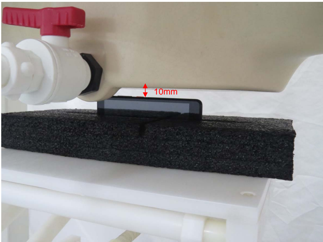
Picture 10: Right Side, the distance from handset to the bottom of the Phantom is 10mm