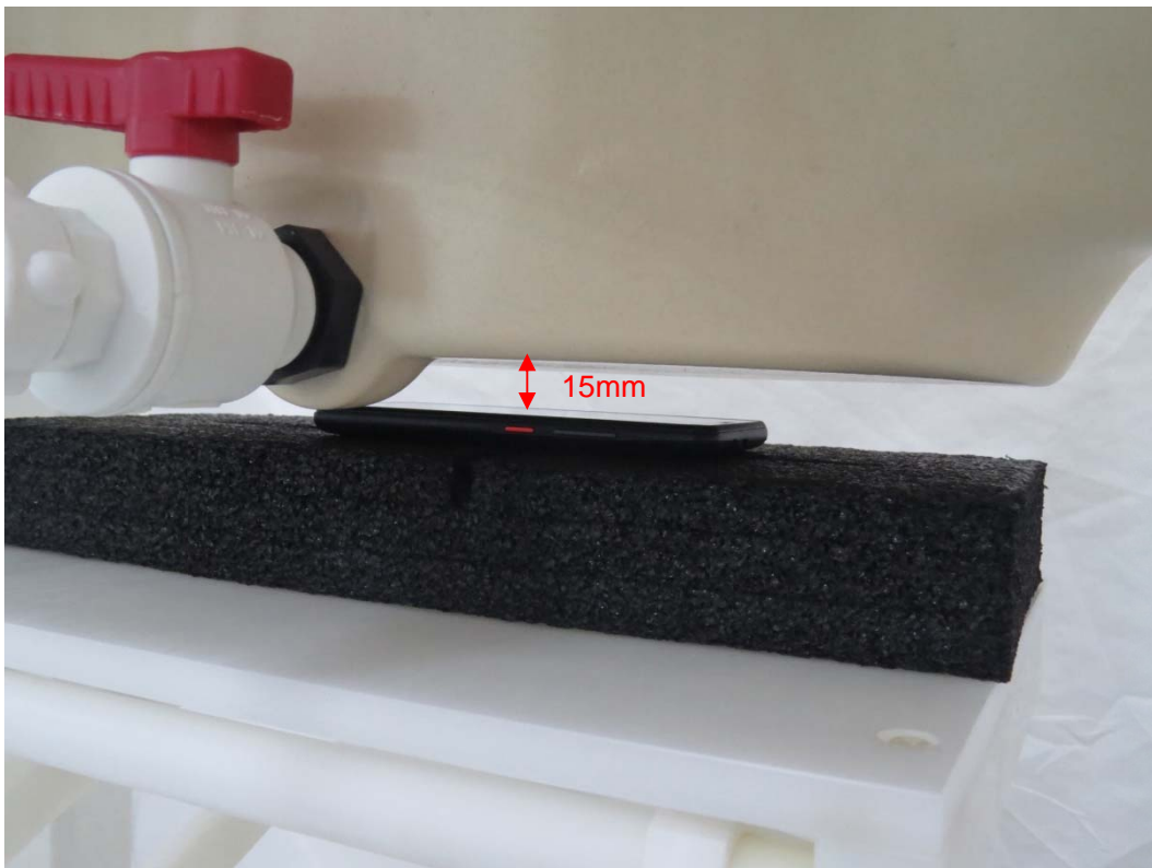
Picture 6: Front Side, the distance from handset to the bottom of the Phantom is 15mm