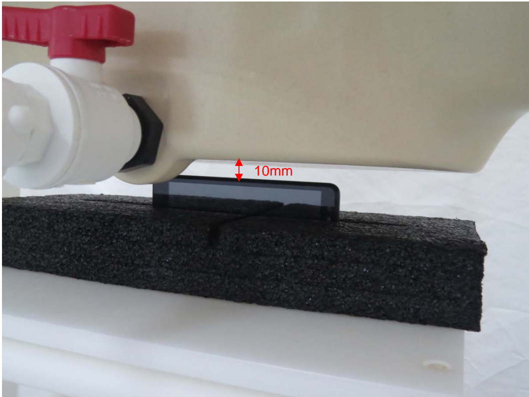
Picture 9: Left Side, the distance from handset to the bottom of the Phantom is 10mm