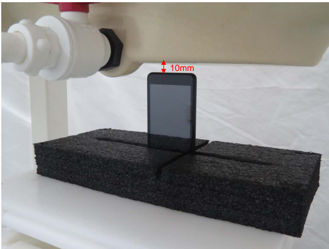
Picture 12: Bottom Edge, the distance from handset to the bottom of the Phantom is 10mm