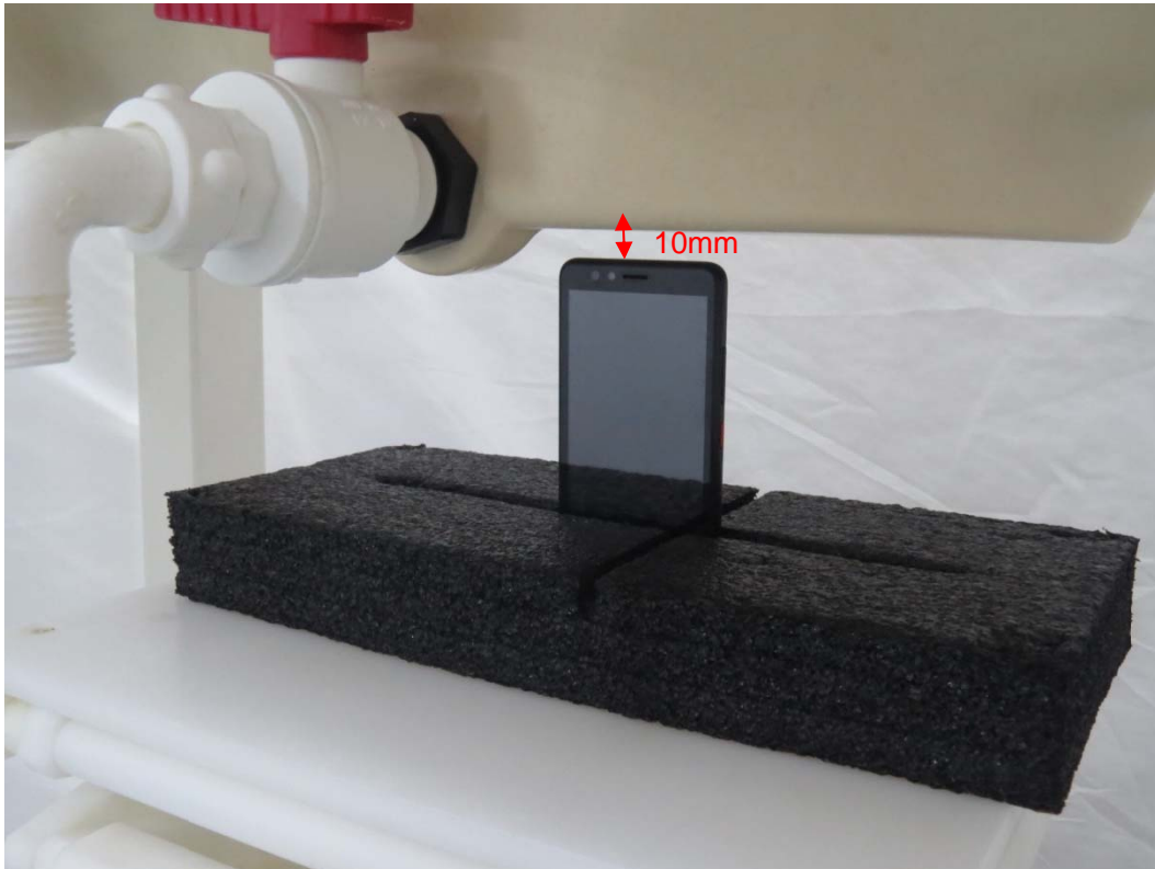
Picture 11: Top Side, the distance from handset to the bottom of the Phantom is 10mm