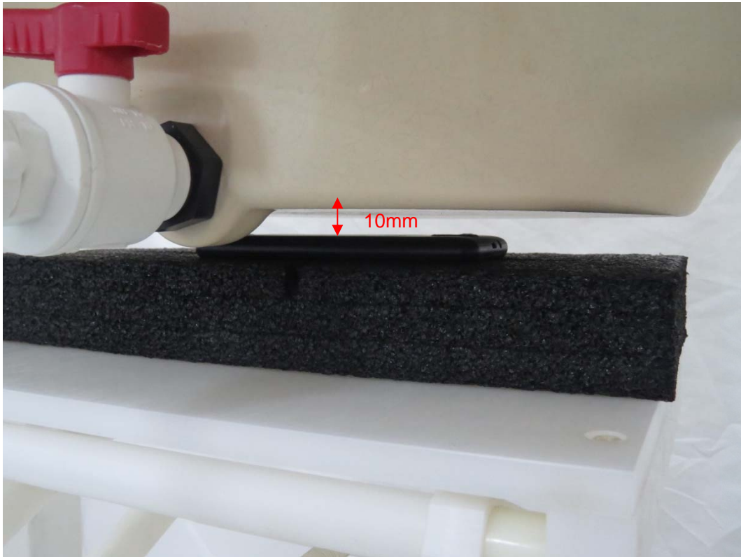
Picture 7: Back Side, the distance from handset to the bottom of the Phantom is 10mm