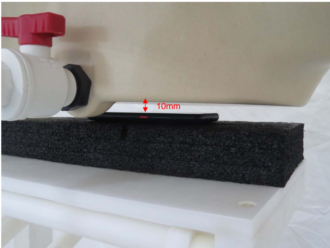
Picture 8: Front Side, the distance from handset to the bottom of the Phantom is 10mm