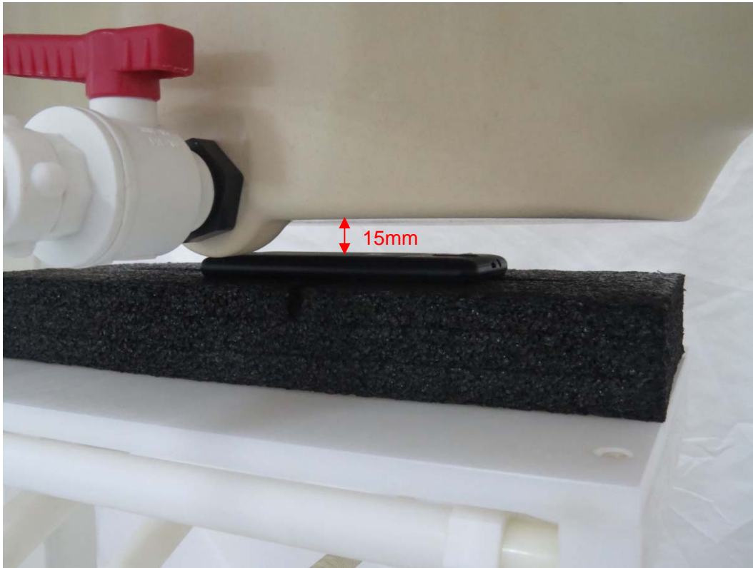
Picture 5: Back Side, the distance from handset to the bottom of the Phantom is 15mm