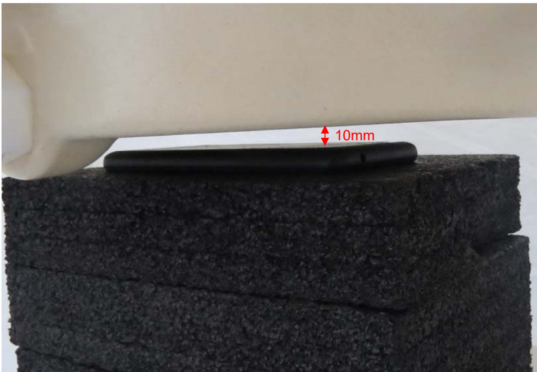
Picture 2: Back Side, the distance from handset to the bottom of the Phantom is 10mm