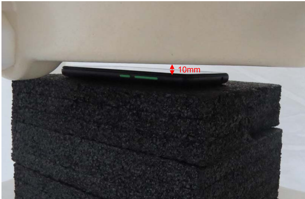
Picture 3: Front Side, the distance from handset to the bottom of the Phantom is 10mm