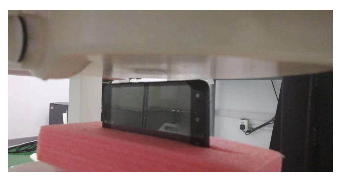
Toward Left (10mm)