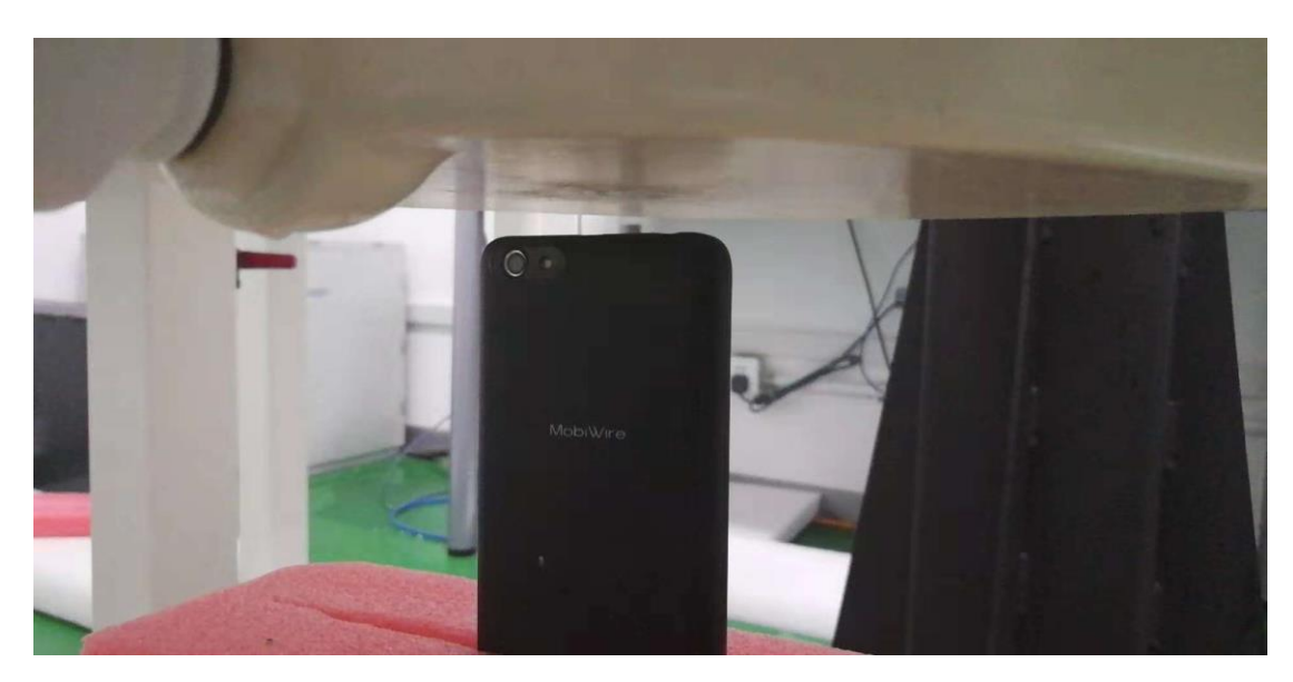
Toward Top (10mm)