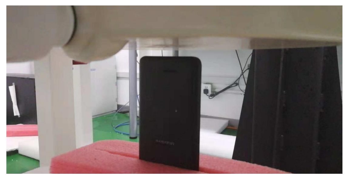
Toward Bottom (10mm)