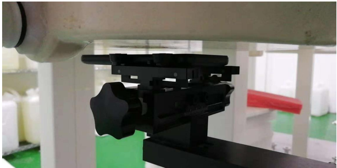
Left Head Touch Cheek Position