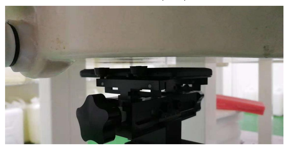
Toward Ground (10mm)