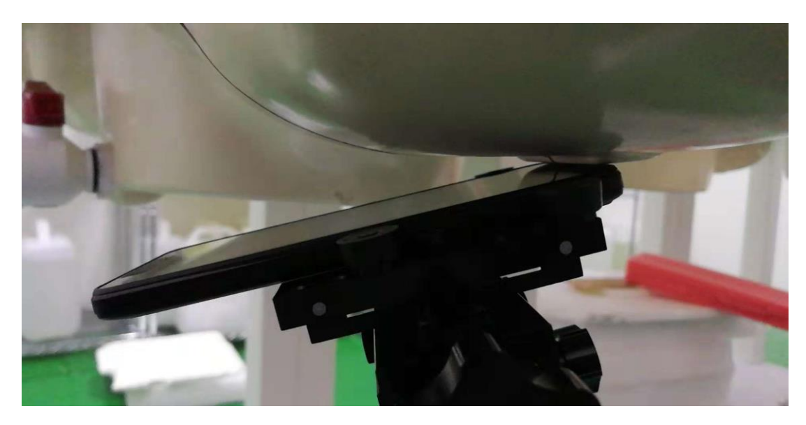
Left Head Tilt 15° Position