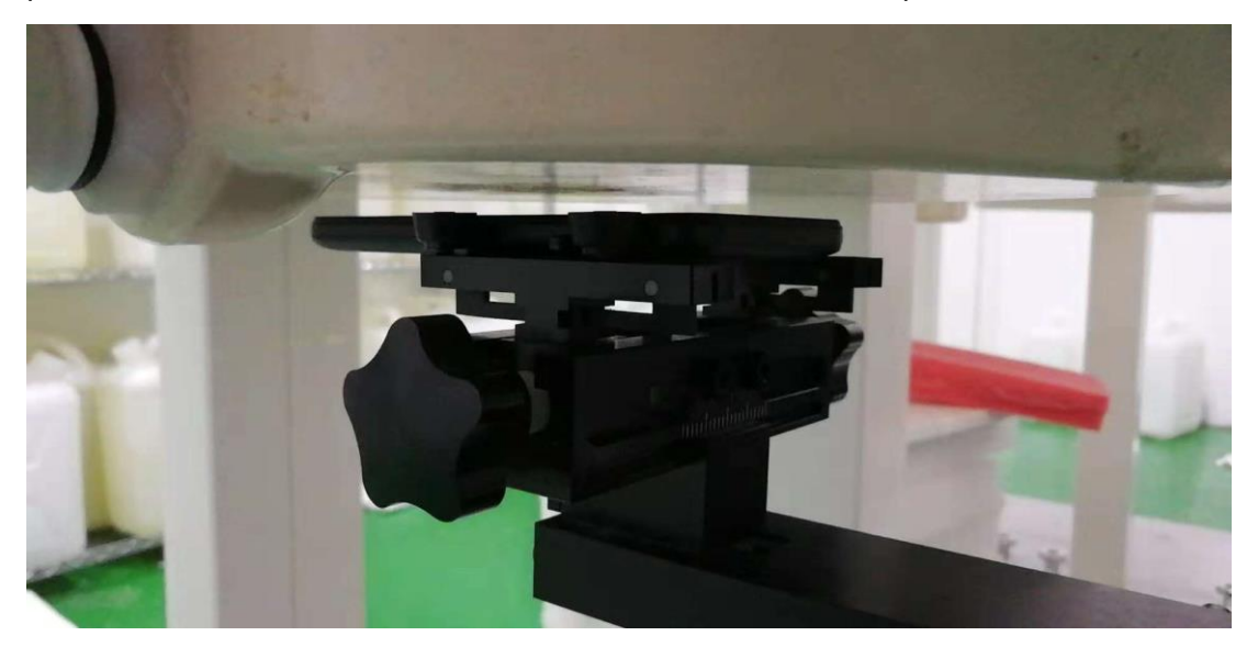
Toward Phantom (10mm)

According to the antenna position, the Body SAR is tested at the following 6 test positions all with the distance =10mm between the EUT and the phantom bottom: