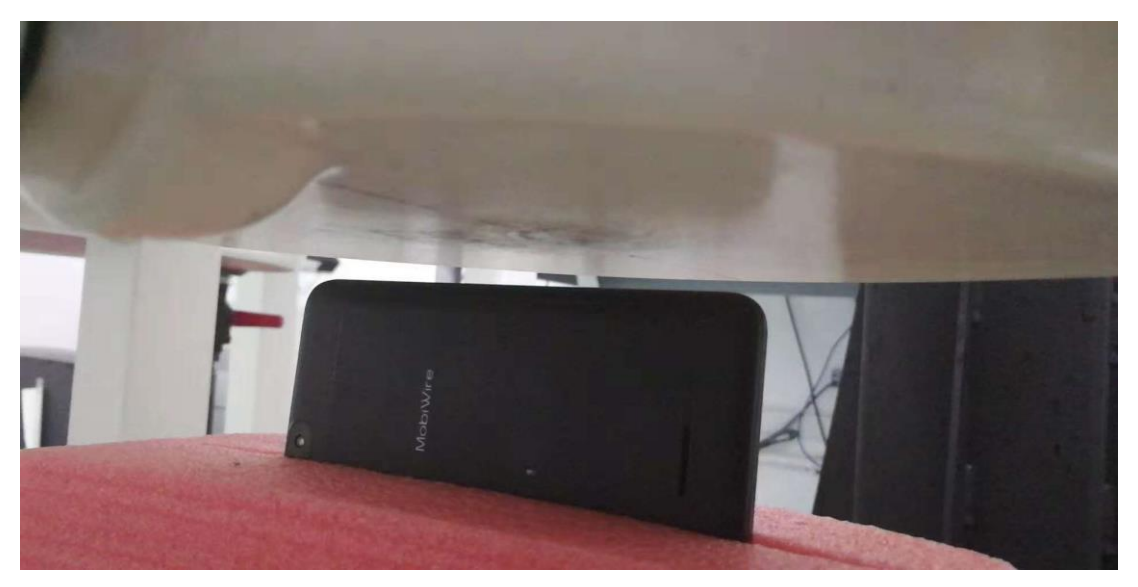
Toward Right (10mm)