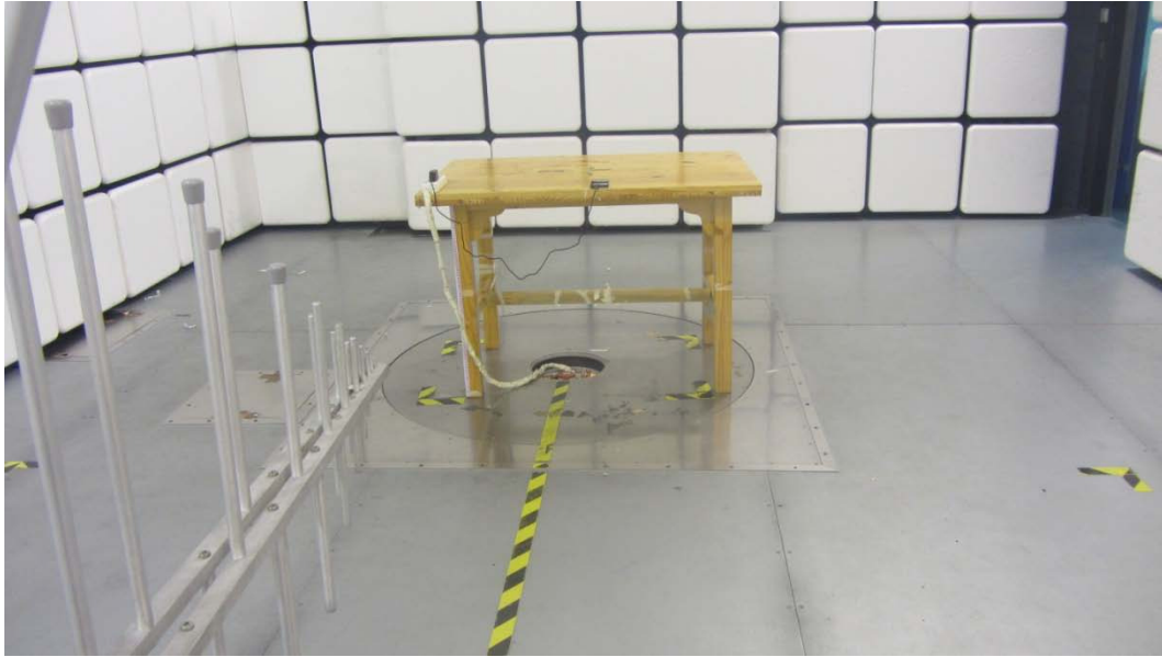
a: Below 1GHz