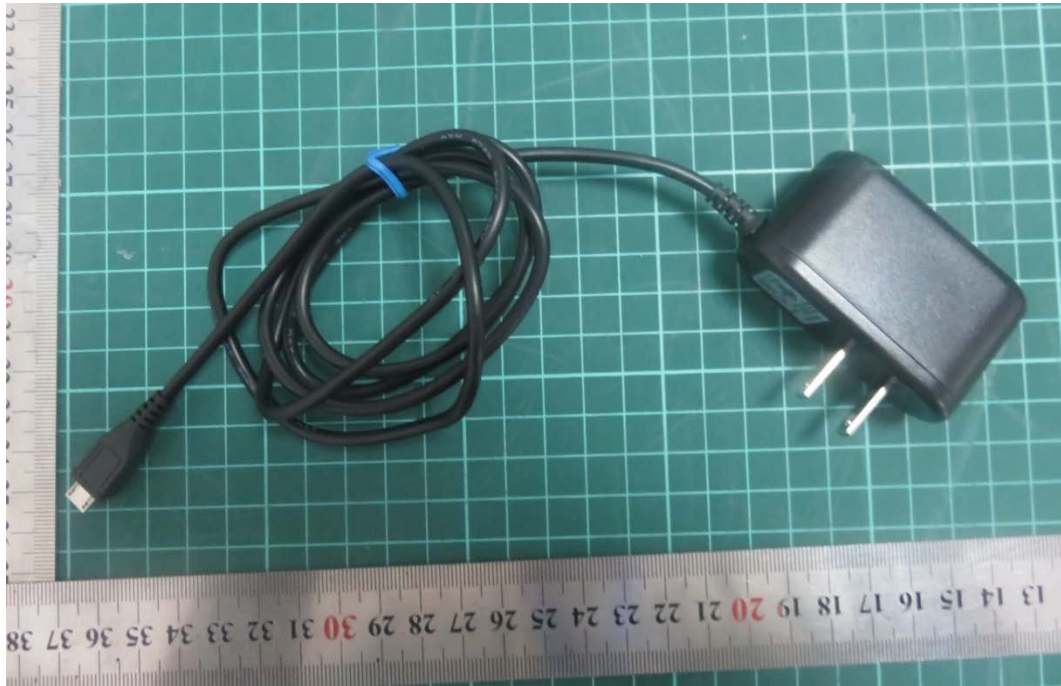
b: Adapter Picture 1 EUT