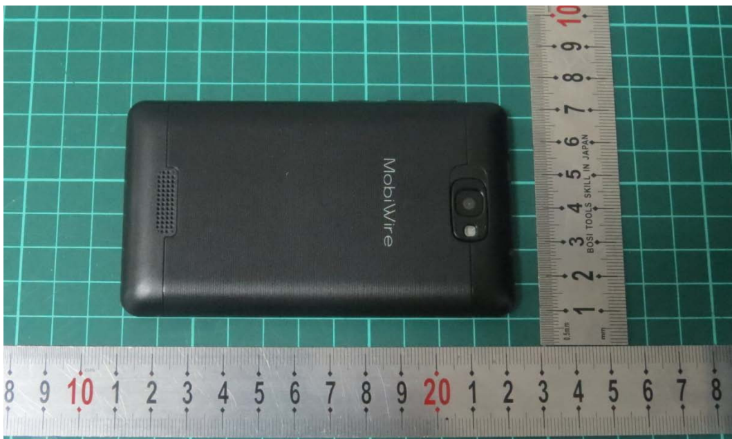
Back Side a: EUT