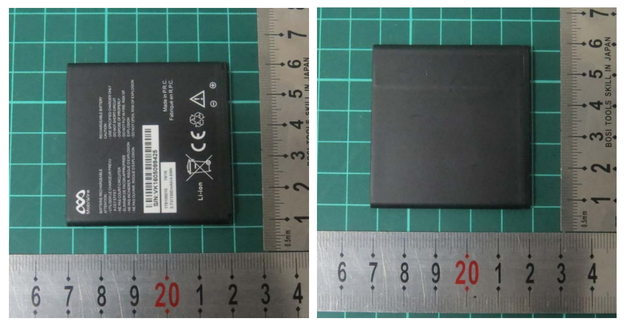
b: Battery Picture 1 EUT