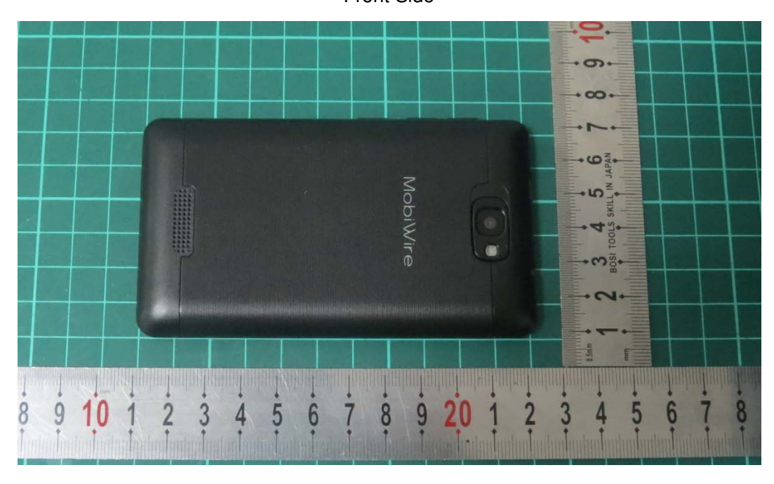
Back Side a: EUT