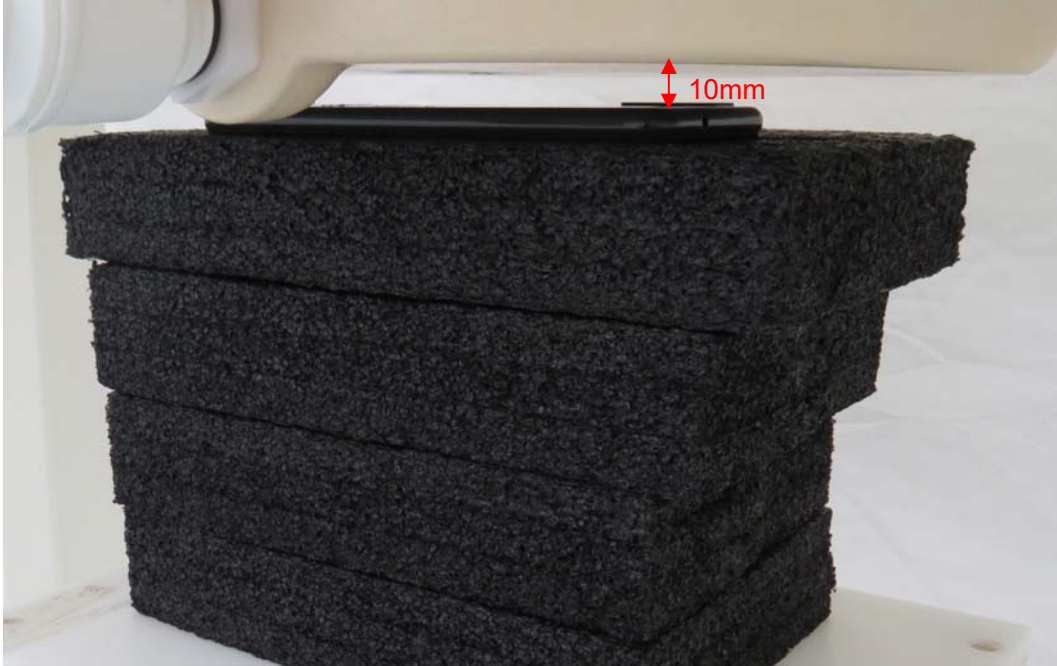
Picture 5: Back Side, the distance from handset to the bottom of the Phantom is 10mm