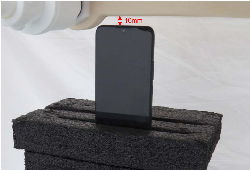
Picture 10: Top Edge, the distance from handset to the bottom of the Phantom is 10mm