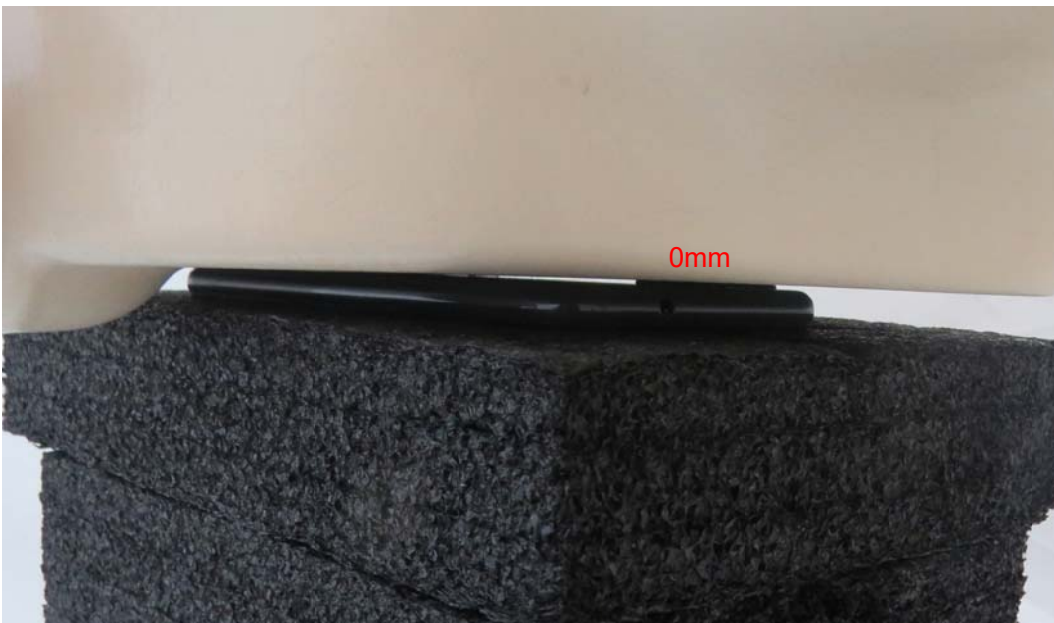
Picture 12: Back Side, the distance from handset to the bottom of the Phantom is 0mm