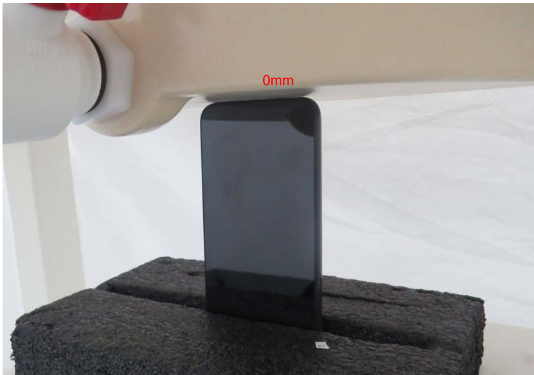
Picture 14: Bottom Edge, the distance from handset to the bottom of the Phantom is 0mm