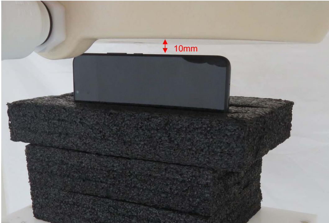
Picture 9: Right Edge, the distance from handset to the bottom of the Phantom is 10mm