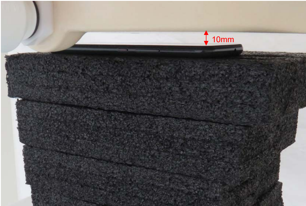
Picture 7: Front Side, the distance from handset to the bottom of the Phantom is 10mm