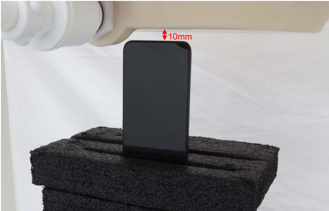
Picture 11: Bottom Edge, the distance from handset to the bottom of the Phantom is 10mm