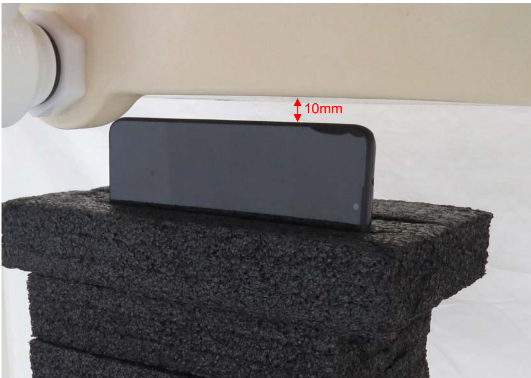
Picture 8: Left Edge, the distance from handset to the bottom of the Phantom is 10mm