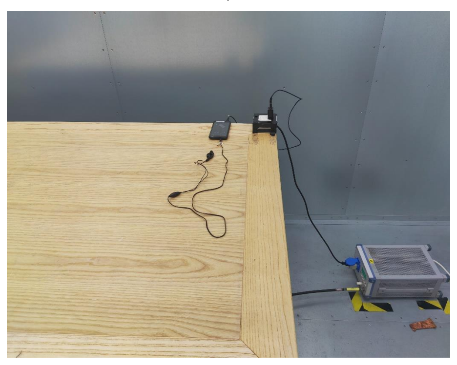
Description: Radiated Emission Test Setup (30 MHz -1000MHz)

Description: Conducted Emission Test Setup