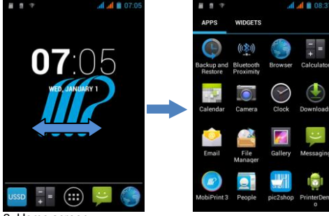
2. Home screen