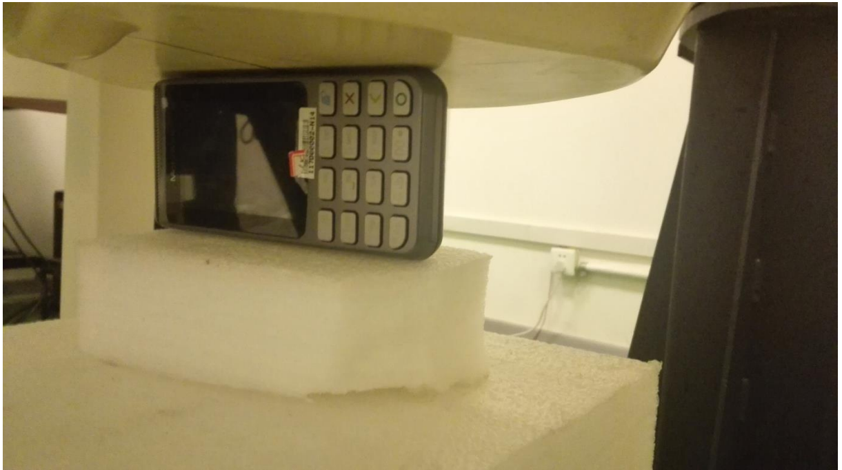
Toward Right (0mm)