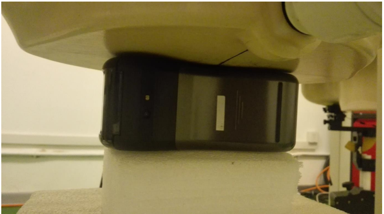
Toward Left (0mm)