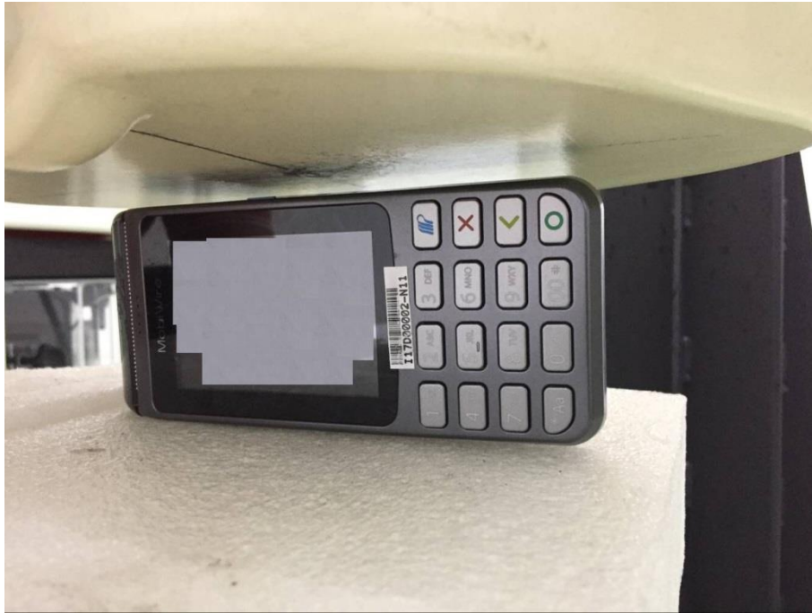
Toward Right (5mm)