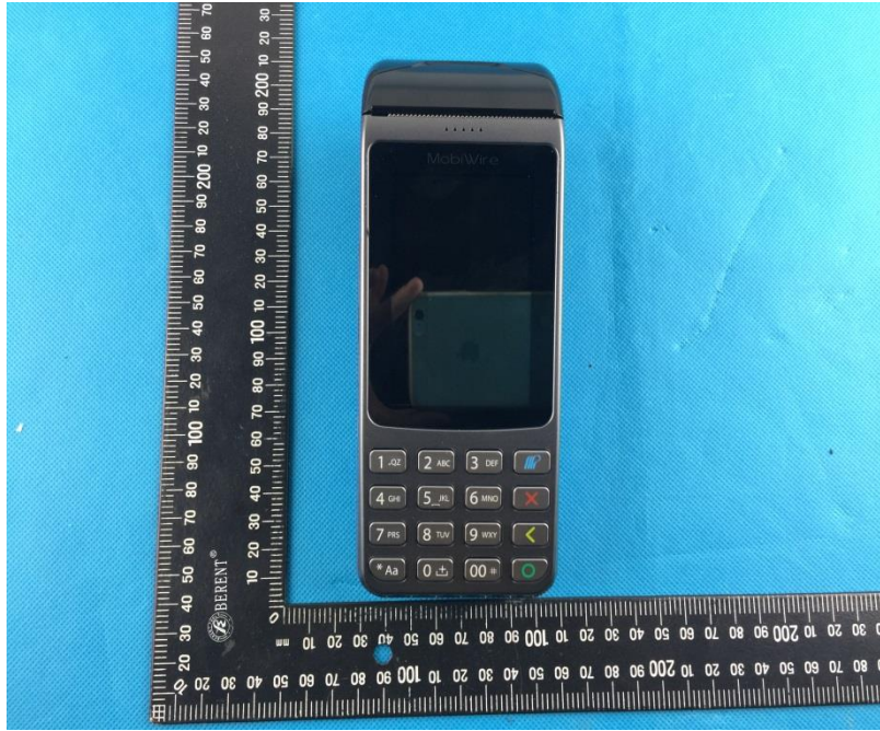
Constituents of the sample