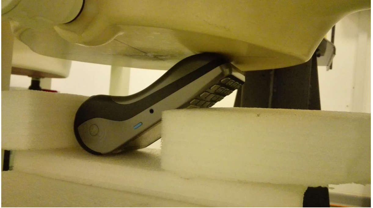
Toward Ground Tilt (0mm)