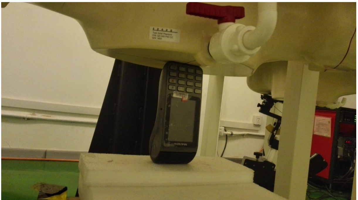
Toward Bottom (0mm)