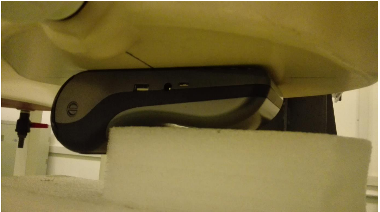
Toward Phantom (0mm)