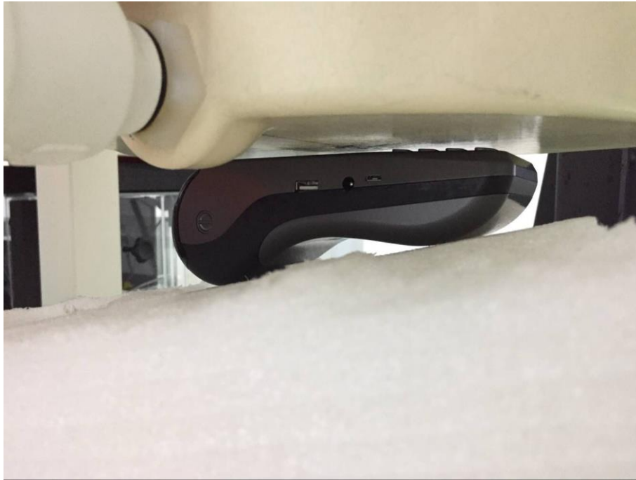
Toward Phantom (5mm)