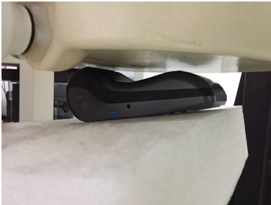
Toward Ground Cheek(5mm)