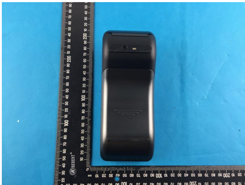
Constituents of the sample