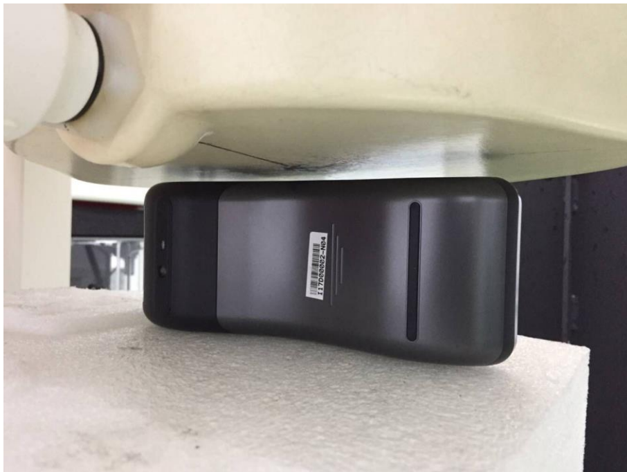
Toward Left (5mm)