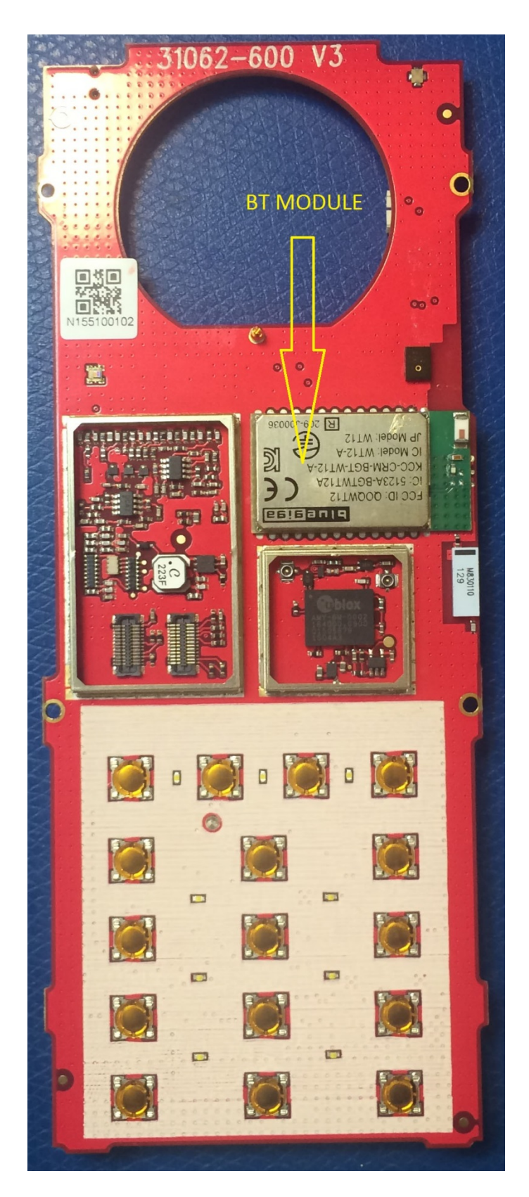
BOTTOM VIEW - NO SHIELDS - WITH BT SHOWN