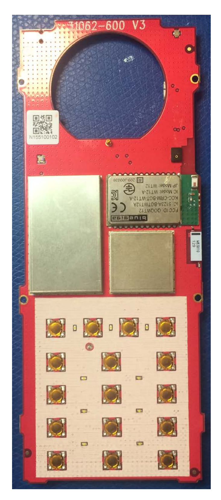
BOTTOM VIEW – WITH SHIELDS