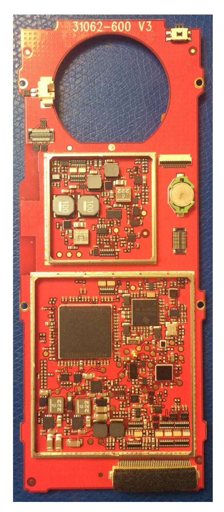
TOP NO SHIELDS