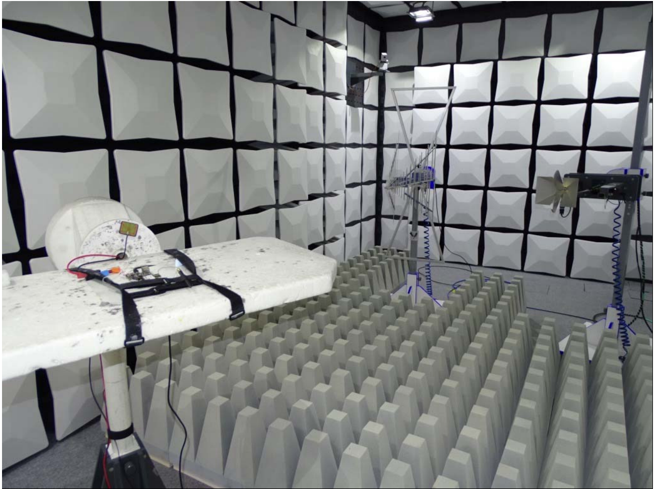
Photo 4: Test setup for radiated measurements in fully-anechoic chamber above 1 GHz