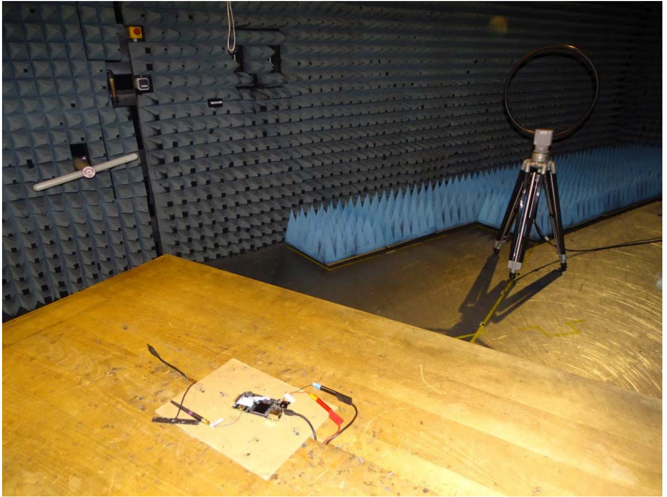
Photo 1: Test setup for radiated measurements below 30 MHz, side view