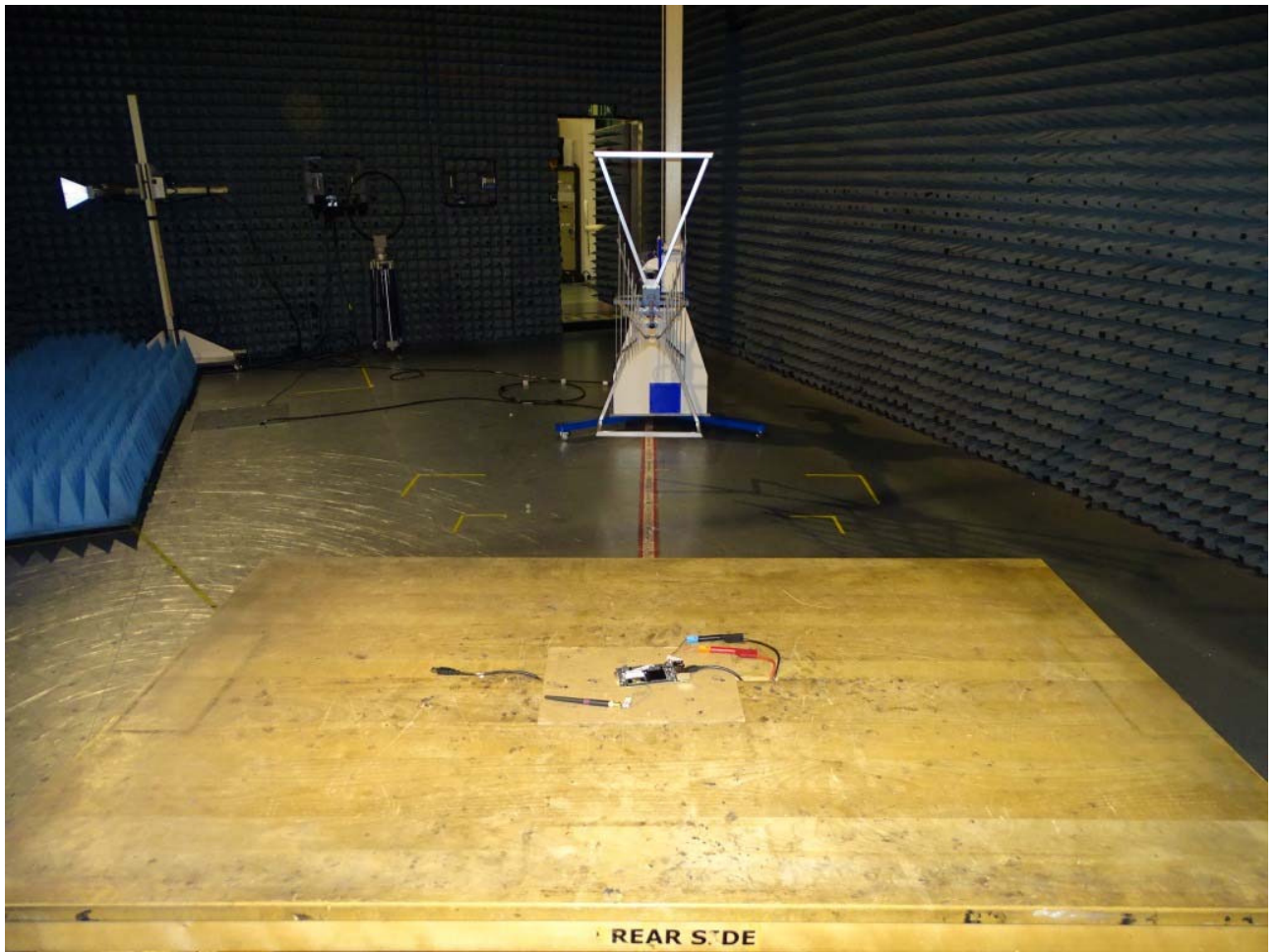
Photo 3: Test setup for radiated measurements in semi-anechoic chamber, 30 MHz to 1 GHz