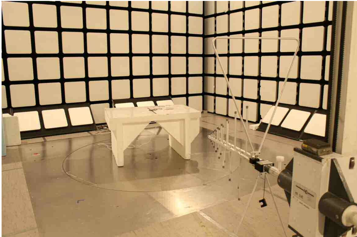
Photograph 1. Radiated Spurious Emissions 30 – 1000 MHz