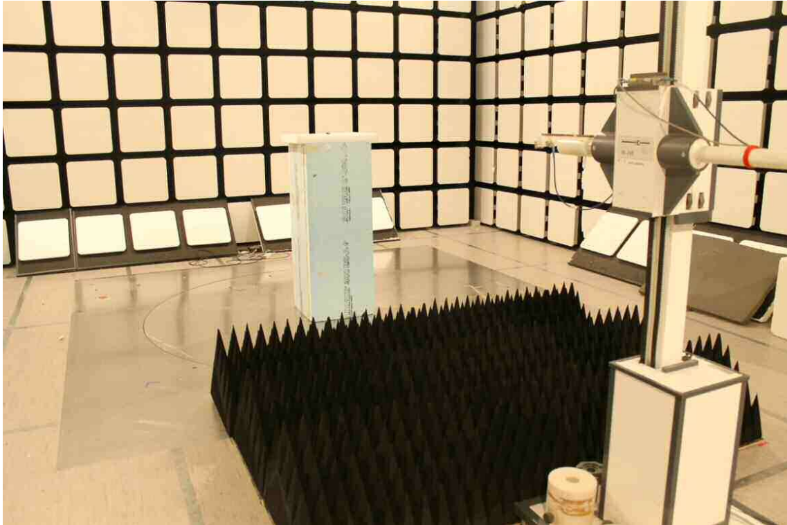
Photograph 3. Radiated Spurious Emissions 18 – 26.5 GHz