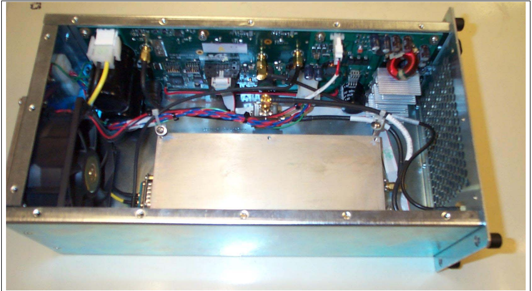
Figure 3. Power Module with power amp heat sink removed, left oblique view.