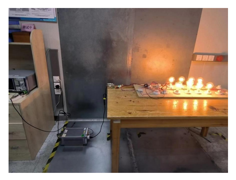
Radiated Emissions From 30MHz-1000MHz