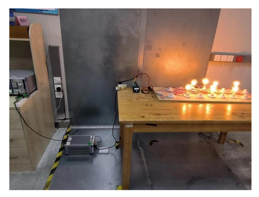
Radiated Emissions From 30MHz-1000MHz