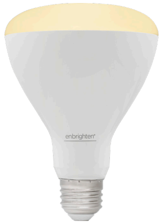
Standard E26 base