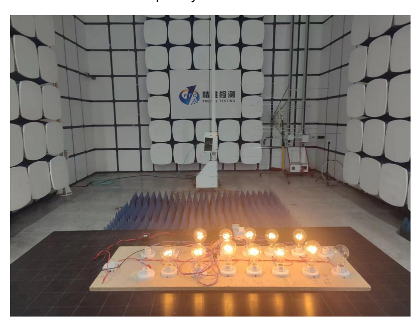
Test frequency from Above 1GHz